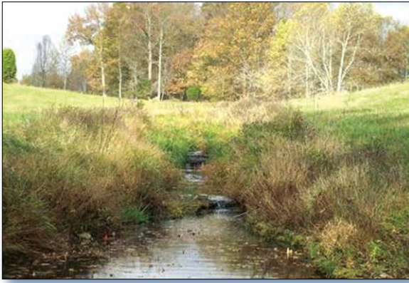
Figure 2. This Cannon County stream is typical of those found in this ecoregion.

improve water quality (Table 1). The SCDs organized hands-on field days to help farmers understand the harmful effects of sediment loss and to encourage them to implement BMPs.