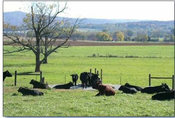
Figure 3. Farmers offer alternative water sources for their animals in rotational grazing areas.

BMPs implemented along McKnight Branch (see Figure 1 for BMP locations) are helping to control erosion and reduce siltation, which in turn has allowed the waterbody to meet water quality standards. In 2007, following BMP implementation, TDEC staff performed a bioecon study at River Mile 3.0 (upstream of Trimble Road in Porterfield). The principal metrics used for the survey are (1) the number of families (or genera) of mayflies, stone-