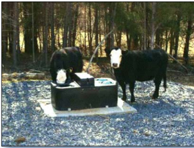
Figure 2. Project partners installed alternative water sources for cattle in the Flat Creek watershed.

implementation plan for the project area, including all four creek subwatersheds; the plan included a timeline for implementing a variety of BMPs.