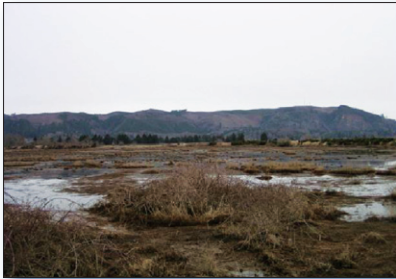
Figure 2. Numerous stakeholders partnered on the Potter Slough Estuary restoration project, shown here after completion.

Multiple landowners and agencies (NRCS, Ducks Unlimited, Washington Department of Fish and Wildlife, and Washington State Department of Transportation) partnered on an eight-year effort (2000 to 2008) to remove a dike and restore 300 acres of estuary wetlands at Potter Slough in the lower Willapa River watershed (Figure 2). This project area provides wildlife habitat and has improved water quality by removing livestock from tideland pastures.