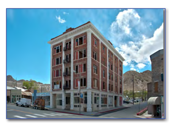
The former Belvada Hotel prior to renovations

The Nevada Section 128(a) Response Program has been working closely with the Town of Tonopah to renovate its existing Visitor and Convention Center facility and to expand the Town's facilities by restoring the rundown and vacant Belvada Hotel. The existing Visitors and Convention Center is a single-story building constructed during World War II. Maintenance and utility costs required to keep this building open and functioning have become too high for the Town to continue to operate the facility as-is. Tonopah officials have identified an answer to reduce operating costs and grow its capability for tourism while maintaining the town's gritty, 19th century boom town heritage by renovating the existing Convention Center and refurbishing the historic Belvada Hotel building. The five-story Belvada Hotel, less than a block away from the Convention Center, was constructed in 1906 in the Neo-Classical style with brick facade and stone pilasters, and a flat roof with a pediment-like stepped central parapet. Although vacant for the last 25 years, the building has housed a bank, convenience store, numerous retail shops, and apartments through its life. Ownership has fallen to the Town through donation and the plan is to move the Visitors and Convention Center offices, the town library, and other municipal offices into this handsome building once