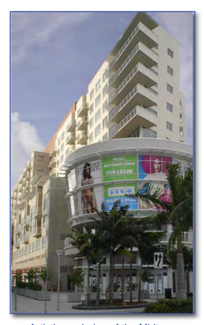
Artist's rendering of the Midtown Miami Project

http://www.dep.state.fl.us/waste/categories/wc/pages/cleanup/pages/nplsites.htm