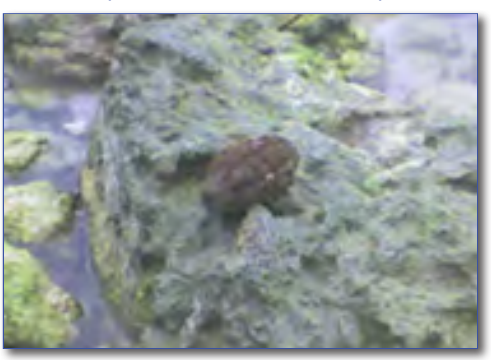
UXO found by a group of children at Micro Beach in Garapan, Saipan