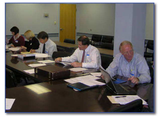
Attendees at "Grant Party" conduct peer reviews of draft grant applications

http://waste.ky.gov/SFB/Pages/default.aspx