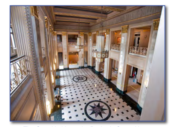
The Grand Lobby at the Peabody Opera House

The Peabody Opera House re-opened in October 2011 after a $79 million renovation. This 68,180-square foot Art Deco building was built in 1934 as a municipal opera house – a landmark in St. Louis. The last concert was hosted in 1991 and the building became a dark and depressing eyesore. While no Recognized Environmental Concerns were identified in the Phase I Report, asbestos-containing material (ACM) and lead-based paint (LBP) were found throughout the building. The site was enrolled in the Section 128(a) Response Program funded Missouri Brownfields/Voluntary Cleanup Program for oversight of the remediation process. During the redevelopment, ACM and LBP were either removed and disposed of, or encapsulated – with the exception of some decorative features containing LBP on the walls and ceilings of the building. These decorative features were preserved in the unlikely situation that the structure is ever used for residential purposes. The Peabody Opera House now hosts many events—a mix of concerts, comedy, touring Broadway shows, and family events—in the main 3,500-seat theatre.