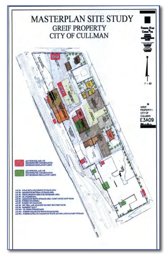
The Master Redevelopment Plan for the Greif property in Cullman