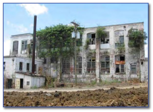
Before picture of the former 1910 Building

The Developer entered into a Voluntary Cleanup Contract with the state's Section 128(a) Response Program. Environmental assessments revealed the presence of volatile organic compounds (VOCs), semi-VOCs and heavy metals within the surface and subsurface soils. While many remedial technologies were considered, a grid pattern sampling assessment and excavation and removal of impacted areas was determined as the best approach. Nearly 300 tons of soil was excavated and disposed of at a Subtitle D Landfill. This project was completed in January of 2011. A Certificate of Completion for the Brownfields Non-Responsible Party Voluntary Cleanup Contract is dated February 4, 2011. The cost of the environmental work was $90,500.00. Other funding sources leveraged included: IRS Section 42 Federal 9percent Low-Income Housing Tax Credits converted to cash through the Federal Exchange Program; Department of Housing and Urban Development (HUD) funds through the Federal HOME Program; Federal and State Historic Tax Credits; and State Textile Mill Tax Credits. The total development cost was $8,633,223.