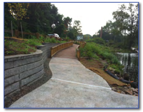
Riverside trail at the Knowles Mill Park

http://www.dem.ri.gov/programs/benviron/waste/topicffp.htm