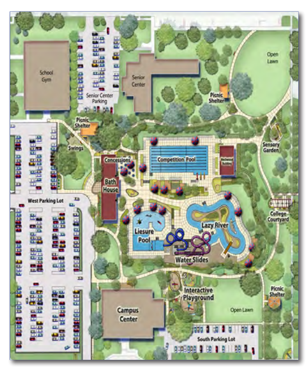
Area Master Plan for Central Park in Huron