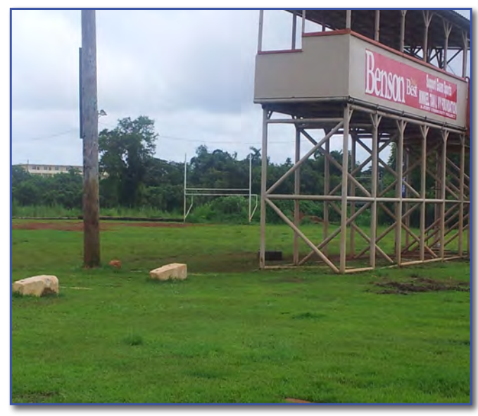
Year-round sports fields at the former brownfield property