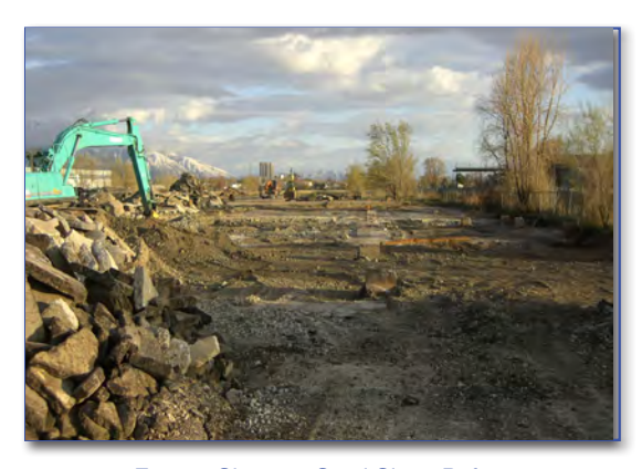
Former Simpson Steel Site - Before

Cleanup of the former Simpson Steel site was completed in 2009 and a COC was issued under the VCP in March 2010. A transit oriented development became the driving force for the transformation of this underutilized, industrial property since a light rail station is directly adjacent to the site. Today, the site is known as the Lions Gate development. The first phase was completed in spring 2012 with the completion of 400 apartment units. The next phase of the development will include low-income housing units as well as retail, restaurant and office space – all of which will be less than a five minute walk to a light rail station.