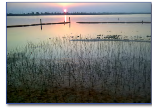
Wetlands Restoration work by CSXT included replanting approximately 25,000 wetlands plants on the former Gautier Oil Site

http://www.deq.state.ms.us/MDEQ.nsf/page/GARD_home?OpenDocument