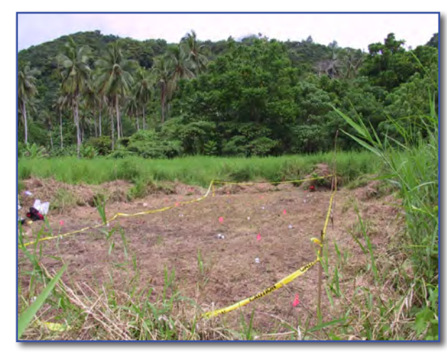
Malaeloa Small Arms Firing Range

Hazardous Materials http://asepa.gov/hazardous-materials.asp