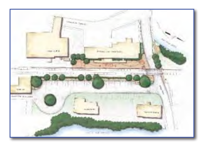
Artist's Rendition of the Union Station Project

The Town of Brattleboro's Waterfront/Union Station project is under construction after years of planning. The project consists of several parcels formerly used for industrial and commercial purposes (i.e., manufactured gas plant, warehouse, auto service, and railroad) that are being reused as a location for multimodal transportation and a waterfront park along the Connecticut River. Cleanup activities included the removal of three underground storage tanks (UST) and adversely impacted soils, building demolition, and the installation of engineering controls (i.e., cap as direct contact barrier) coordinated with ICs and an ongoing Operations and Management Plan. Funding for these activities was provided by the Vermont Department of Environmental Conservation's (VTDEC) Section 128(a) Response Program funds ($85,000), EPA Petroleum Brownfields funding, along with VTDEC American Recovery and Reinvestment Act (ARRA) petroleum funding and other transportation related funds. A COC is expected to be issued in late 2012 pending approval.