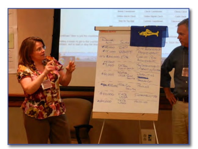
At the spring 2012 Redevelopment "War Games" groups provided feedback on the redevelopment process defined by the BAC and how their organizations fit into that process

The West Virginia Brownfield Assistance Centers (BAC) at Marshall University and West Virginia University initiated the WV Redevelopment Collaborative, funded through a private foundation, in order to provide project assistance. The Decision Enhancer Tool (DET) is a resource for communities to collect site information to develop a 'site story' to guide revitalization planning, assist with completing applications for funding, and attracting potential developers and investors. The BACs have conducted workshops around the state to educate communities and organizations on how the DET may be used. The BACs also held a Redevelopment War Games Workshop to provide opportunities for interaction between leaders from state agencies, community foundations, financial institutions, and nonprofit organizations, in training exercises to build a framework to examine collective goals and challenges in strengthening the redevelopment process. West Virginia Department of Environmental Protection used Section 128(a) Response Program funding to assist the BACs with the Annual West Virginia Brownfields Conference, where these resources will be showcased, along with success stories from involved communities. The conference attendance has attracted over 200 participants in recent years. It has keynote speakers ranging from the Governor. Congressional representatives, and top business and community leaders; it is the premiere state event for networking amongst brownfields redevelopment professionals.