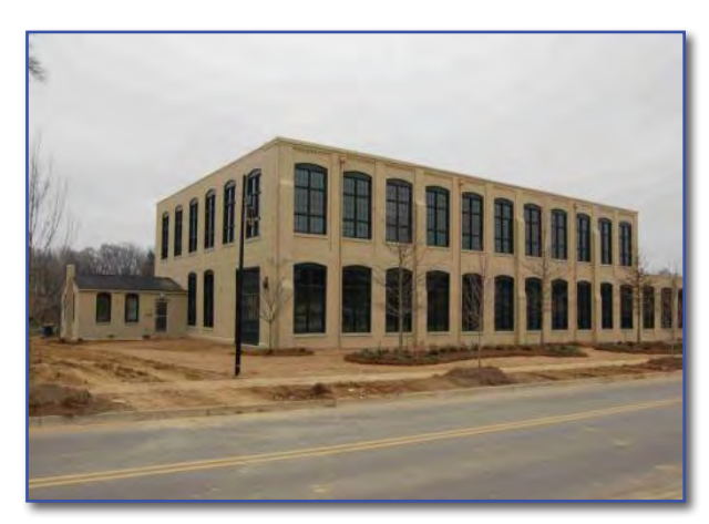
After picture of the former 1910 Building