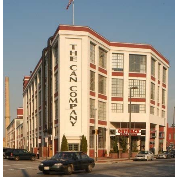
The Shops and Offices at the Can Company and community events, such as the music festival )