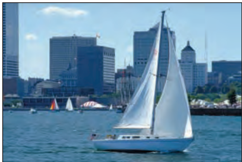
Sailing along Milwaukee shoreline, Milwaukee, Wisconsin Lake Michigan Federation