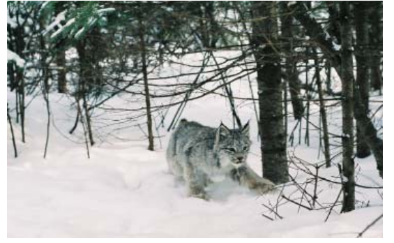
10-month-old lynx kitten in the snow

Lake Superior Basin Herptile Monitoring Program Funding from U.S. EPA-GLNPO will establish and test an intensive monitoring program at several sites within the Lake Superior basin. A data repository will be established, and detection probability statistics will be developed that can be applied to existing programs to advance basin-wide analysis capabilities.