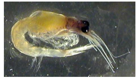
Lower trophic level organism (Mysis)

Hydroacoustics is the use of sound waves to measure or monitor underwater processes. Sound waves travel great distances underwater without losing strength, making this an effective tool for studying the open waters of Lake Superior. In 2005, the University of Minnesota-Duluth and U.S. Geological Survey (USGS) continued a hydroacoustic assessment that ranked as the highest priority Aquatic Communities project. The objective is to determine the abundance of prey fish important to lake trout. Sound waves sent from the ship toward the lake bottom bounce off objects (fish, in this case) and