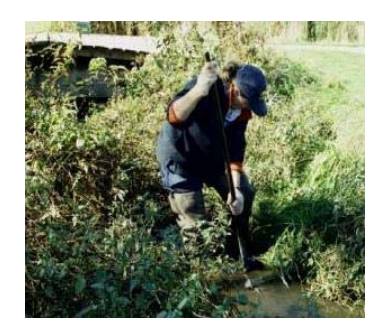
Watercourse Stewardship sampling

Aerial thermography is being used to survey nearshore areas of Lake Superior, the Nipigon River, and the Lake Nipigon shoreline to locate groundwater upwelling areas, which provide critical habitat for coaster brook trout. Through funding from the Canada-Ontario Agreement (COA), an upwelling survey of the Nipigon River and portions of Lake Nipigon and Nipigon