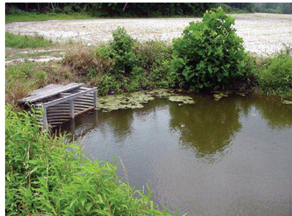
Area farmers installed water table control structures like the one shown here to address excess nutrients.

In response, the North Carolina Environmental Management Commission designated the Tar-Pamlico River Basin as "Nutrient Sensitive Waters" and called for a strategy to reduce nutrient inputs from around the basin. The strategy's first phase, which ran from 1990 through 1994, produced an innovative point source/nonpoint source trading program that allows point sources, such as wastewater treatment plants and industrial facilities, to achieve reductions in nutrient loading in more cost-effective ways. The group cap structure of the trading program has allowed the point source coalition to exceed its reduction targets