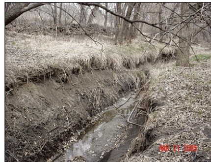
Figure 1. Pre-project condition of a stream draining to Holmes Lake. Severe stream-bank erosion contributed sediment and nutrients to Holmes Lake.

Data collected between 1995 and 1998 show that average concentrations of dissolved oxygen in the water column fell below the water quality standard of 5.0 milligrams per liter (mg/L) for 5 of the 21 surface-to-bottom profiles. Nutrient listings are partially based on growing season mean chlorophyll a concentrations exceeding 44 milligrams per cubic meter (mg/m 3 ). The pre-project (1976–2001) chlorophyll a growing season average value was 46.52 mg/m 3 . NDEQ added sedimentation to the list of pollutants because of the violation of two assessment criteria. The first criterion is the annual sedimentation rate. From 1984 to 1993, the average annual loss of original lake