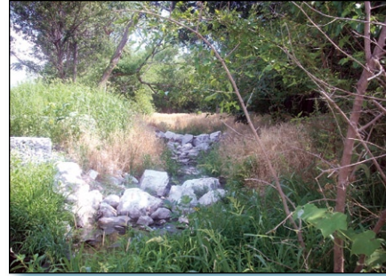
Figure 2. Post-project condition of a stream draining to Holmes Lake. The revegetated stream channel includes rock piles that serve as check dams to slow water flow to the lake.

Of the nine water quality profiles measured from 1999 through 2001, no violations of the state's dissolved oxygen standard were observed (Figure 3). As a result, NDEQ removed dissolved oxygen from the state's 2002 303(d) of impaired waters. Post-project (2006–2007) chlorophyll a values of 17.30 mg/m 3 met standards and prompted NDEQ to remove the chlorophyll a impairment from the 2008 303(d) list. Sedimentation also declined. The average annual lake volume loss fell to 0.13 percent, and sediment removal efforts in the lake reduced the loss of original volume to 14 percent. Consequently, NDEQ removed the sedimentation impairment from the state's 303(d) list in 2008. As a result of the in-lake and watershed improvements, Holmes Lake now fully supports all beneficial uses.