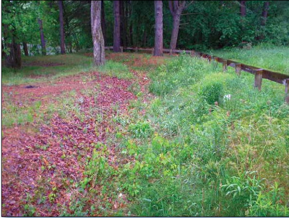
Figure 2. A vegetated swale built to treat road and parking lot runoff before it enters Crystal Lake.

the city to construct BMPs at the second outfall including deep sump catch basins, a stormwater baffle tank, lateral drains, and vegetated swales (Figure 2). As part of the non-federal match for the grant, the city dredged the beach to remove historic sediment and weed accumulations.