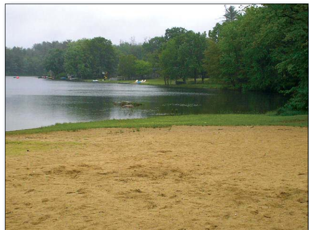
Figure 1. Crystal Lake beach in July 2008.

In 1985 NHDES completed a Diagnostic and Feasibility Study which documented that the main impact to water quality at Crystal Lake resulted from untreated stormwater runoff. The study found that sediments, nutrients, bacteria, and heavy metals were present in elevated levels. The study also noted that deposited sediment was a main component of a phosphorus rich, unconsolidated muck layer that was up to 25 feet deep in spots. In 2006, NHDES added Crystal Lake and Crystal Lake Beach to New Hampshire's section 303(d) impaired waters