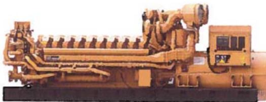
Image shown may not reflect actual package