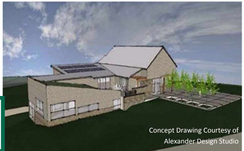
Concept Drawing Courtesy of Alexander Design Studio

A new, much larger library will also benefit the community via increased membership and visitation. Heightened library traffic will benefit the local economy of the community – the greater number of patrons the new library will bring to the community will exponentially increase potential sales and revenue of local area businesses.