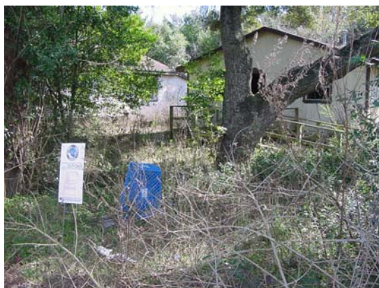
A condemned property near the Escambia site

Congress enacted Public Law 91-646, the Uniform Relocation Assistance and Real Property Acquisition Policies Act (URA) in 1971 to provide for uniform and equitable treatment of people whose homes or businesses were acquired under Federal and Federally assisted programs. The U.S. Department of Transportation has been designated the lead agency for implementation of the URA. Regulations in Title 49, Code of Federal Regulations, Part 24, provide specific rules for conducting permanent relocations. While EPA has an interim policy for temporary relocations, 2 it was not relevant to the permanent relocations at Escambia. Thus, the Escambia relocation was conducted primarily under the URA.