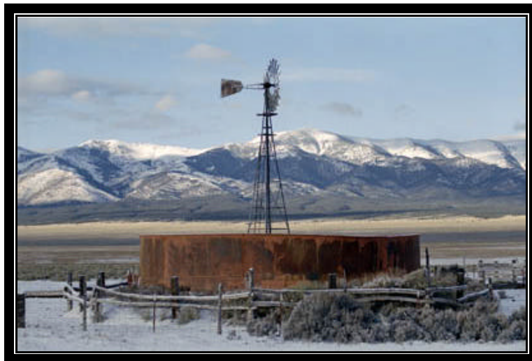
Windmill and Water Tank, Eastern Nevada