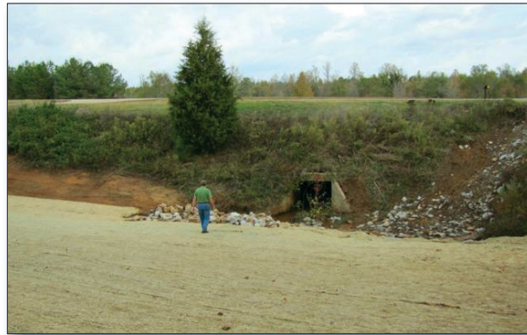
Figure 3. Critical area planting along Caney Creek was necessary to establish permanent vegetation on sites that had high erosion rates.

In 2011 MDEQ returned to the original sampling location in Caney Creek to collect biological community data. The score was 87.92, above the threshold for attainment in this region. Using this 2011 data, a 4.99-mile segment of Caney Creek was assessed as attaining the aquatic life use in the 2014 CWA section 305(b) report.