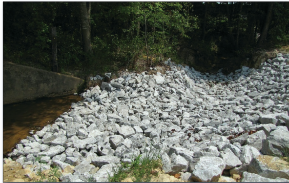
Figure 2. Grade stabilization structures in Caney Creek were used to prevent erosion and enhance the environmental quality of the creek.

pleted by the end of that year. The BMPs supported with CWA section 319 funds included over 40 acres of nutrient management, eight grade stabilization structures (Figure 2), one pond and one critical planting area (Figure 3) within the Caney Creek subwatershed. In addition, conservation practice systems were installed by NRCS in coordination with the watershed project ongoing in the Coke Creek–Caney Creek watershed, including four grade stabilization structures, 128 acres of prescribed grazing, 99 acres of nutrient management, 55 acres of tree/shrub establishment and one animal watering facility.