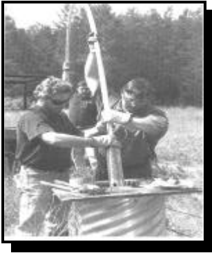
Figure 5: SRS monitoring well.

contamination within the wells increased. For example, in 1996, the average tritium concentration in ORWBG wells was about 11 million picocuries per liter (pCi/L) with the highest annual detected concentration being 160 million pCi/L. These concentrations were 535 and 8,000 times greater than EPA's 20,000 pCi/L MCL for tritium, respectively. In 2000, the average tritium concentration was found to be almost 15 million pCi/L (739 times greater than MCL), and the highest detected concentration was 272 million pCi/L (13,600 times MCL). This increase in tritium concentrations indicates that the ORWBG interim, temporary soil cover may not be adequate to reduce the contaminant migration from the ORWBG soil to the groundwater as originally intended. In a May 2001 meeting between SRS, Region 4, and the State, SRS staff stated that tritium and gross alpha and beta concentrations had increased in the