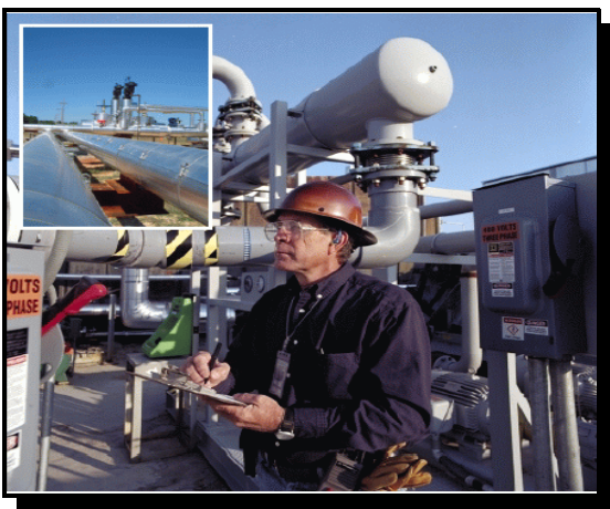
Figure 4: SRS dynamic underground stripping plant for removing solvents from groundwater.

The core team consists of representatives from Region 4, the State, and SRS. Because the team is extensively involved in the scoping of remedial activities and development of cleanup decisions, draft primary documents generally reflect decisions already agreed upon by the three parties to the FFA. The core team concept may substantially reduce the cost of remedial actions in some cases. For example, the team accelerated completion of the Remedial Investigation/ Feasibility Study for one operable unit by 2 years and developed a cleanup proposal for consolidating excavated contaminated soil and related wastes within the unit. This is expected to save $5 million over other cleanup alternatives.