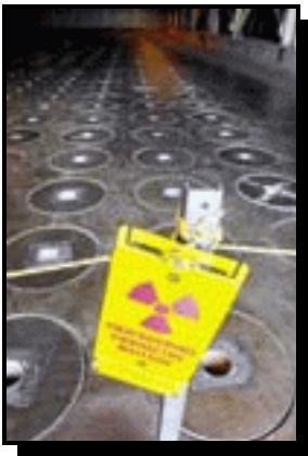
Figure 1: Weapons-grade plutonium stored at SRS.

The SRS was established in 1950 to produce special radioactive isotopes for nuclear weapons (such as plutonium-239 and tritium). In addition, SRS produced other special isotopes to support research in nuclear medicine, space exploration, and commercial applications (such as californium-252, plutonium-238, and americium-241). The SRS includes nuclear reactors, a fuel and target fabrication plant, two chemical separations plants, the Defense Waste Processing Facility, the Savannah River Laboratory, and support operations. SRS generates a variety of radioactive, non-radioactive, and mixed (radioactive and hazardous) wastes. SRS waste management practices (past and present) include the use of seepage basins for liquids, pits and piles for solids, tanks for high-level radioactive mixed wastes, and landfills for low-level radioactive wastes. Federal and contractor staff at SRS totaled more than 13,000 employees, as of December 2001. A map of the SRS showing principal areas of contamination is shown on next page.