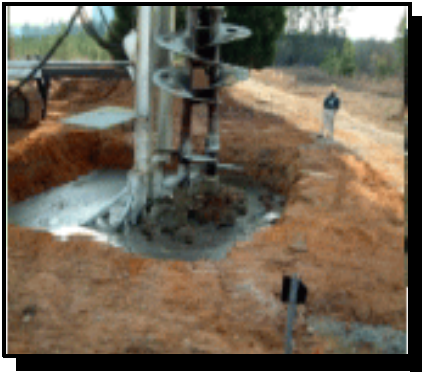
Figure 3: In-situ stabilization (grouting) of K Reactor Seepage Basin

use for most of the CERCLA operable units has been restricted to industrial use or designated to remain in federal control for perpetuity. Since many remedial actions required burial of hazardous wastes on-site, the remedies included institutional controls to preclude human and ecological exposure to the contaminants.