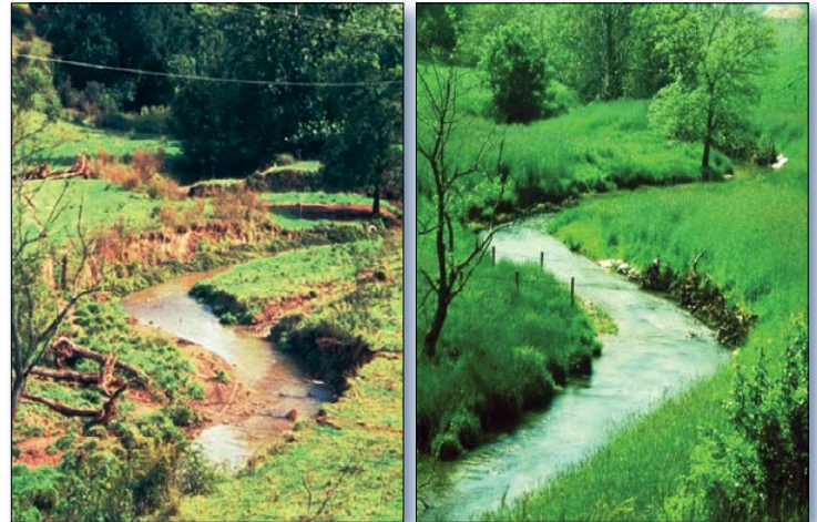
Figure 2. Photos taken before (left) and after (right) a landowner installed a livestock exclusion system in the Hutton Creek watershed.

1 A score above 60 shows support of biological integrity