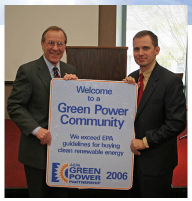
Oregon's Governor Kulongowski and EPA's Matt Clouse holding a Green Power Community sign