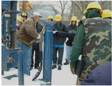
Students from the Brownfields Job Training program at the Heritage Health Foundation in Pennsylvania

The First Coast Workforce Development Agency, known as WorkSource, provides employer services (primarily, matching workers with jobs) in six counties along Florida's