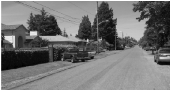
(Above) Broadview neighborhood before construction (wide streets and no drainage system).