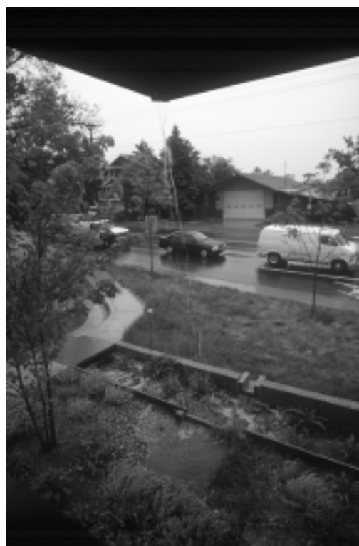
Roof drainage pours into a garden next to the building.

The swale and garden system requires relatively little maintenance, said Kaas. "Right now we are providing supplemental irrigation during the driest months of the year. A landscape company also comes in to make sure the weeds don't take over the newly landscaped beds. If our staff sees trash collected in the grassy areas, they make an effort to dispose of it. The system itself was developed to be self-sustaining."