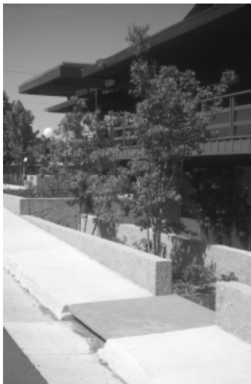
Runoff flows under sidewalk into gardens around the building.

Following this vision, the organization purchased a half-acre site along a busy street for their headquarters. First they reduced nonrenewable energy use by 85 percent by retrofitting the building with energy saving measures like reflective windows and solar panels. In the spring of 1999, at a cost of about $113,000, the LAW Fund installed a water-efficient landscape system that uses swales and gardens to funnel and capture runoff from the building roof and parking lot. Following are some of the highlights of their efforts: