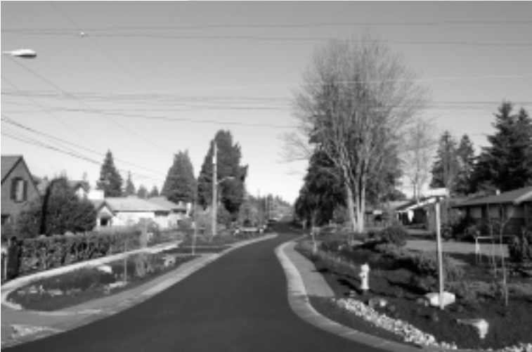
(Below) Broadview neighborhood after construction (curving street bounded by drainage swales and gardens).

SPU, working with other city departments, assessed many neighborhoods in Seattle to identify good candidates for reconstruction. Once they developed a list of 30 potential blocks, they invited all the residents to a public meeting to discuss the proposed changes. They sent the residents home with petitions to sign up their neighbors. To qualify for further consideration, the neighborhood had to have signatures from at least 60 percent of the residents on the block.