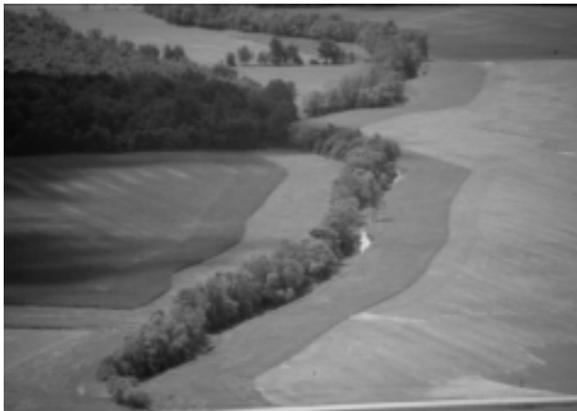
Grass filter strips and riparian buffers protect water quality in Ohio's Lake Erie watershed.

A new program in Ohio will buffer Lake Erie and its watershed from the impacts of agricultural nonpoint source runoff. In 1998 the Ohio Lake Erie Commission released The Lake Erie Quality Index , which identified soil erosion and sediment transport as the leading cause of water quality impairment in the Lake Erie watershed. Shortly thereafter, the U.S. Department of Agriculture's Natural Resources Conservation Service (NRCS) convened a meeting of several public and private agricultural and natural resource agencies to discuss ways to improve water quality in Ohio's Lake Erie watershed, more than 75 percent of which is in cultivated cropland. The group decided that the installation of buffers, an effective method of reducing sediment loss from the land, was the best option for reducing water quality impairments.