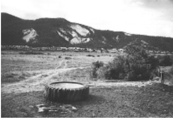
Crosswhite uses large tires for alternative watering troughs.

for the grant, Crosswhite contributed $5,000 for the electric power and piping. The following year, the AWPf provided another $30,000 to extend the number of alternative watering systems along elk migration routes on Crosswhite's property to reduce the elks' impact on the creek's riparian corridor. As part of the AWPf project, a range consultant will study the elk, inventory the wildlife and vegetation, and assess the success of the livestock management plan over time.