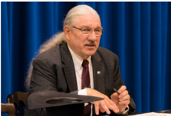
Butch Blazer, Deputy Under Secretary for Natural Resources & Environment