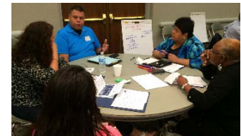
EJ IWG Tribal Meeting in Bismark, North Dakota