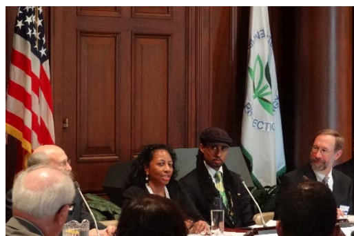
EJ IWG Senior Principals Meeting