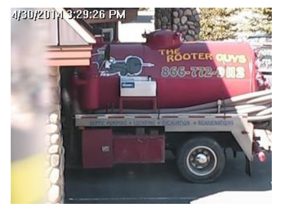
Still Images from Surveillance Video

The case was investigated by EPA's Criminal Investigation Division with the assistance of the city of Hayden, the Hayden Area Regional Sewer Board, the FBI, the U.S. Forest Service, U.S. Secret Service, and the Kootenai County Sheriff's Office.