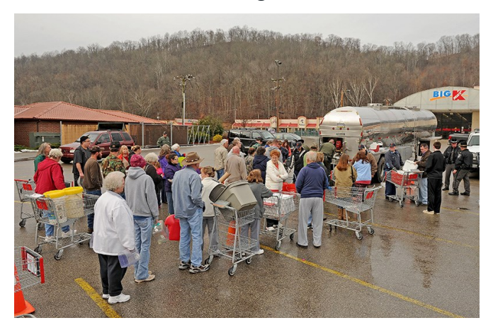
Charleston Residents Waiting for Drinking Water

Freedom had a permit issued by West Virginia's Department of Environmental Protection that allowed for the discharge of storm water and groundwater subject to monitoring and reporting