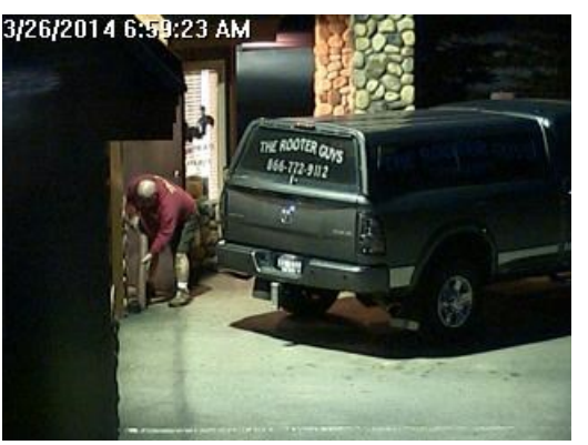
Still Image from Surveillance Video