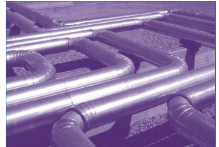
A natural gas pipeline.

United Nations Development Programme (UNDP) and the United Nations Environment Programme (UNEP) provide grant funding through the Global Environment Facility (GEF) to developing or transitional economies. < www.gefweb.org >