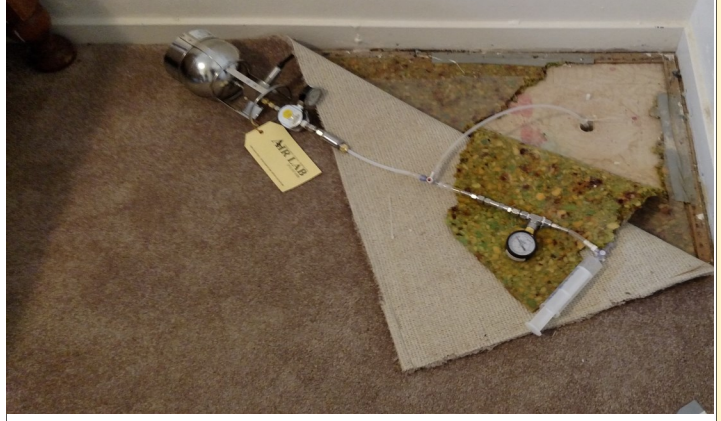
Above: Sub-slab air sampling location within Eastern Heights Subdivision.