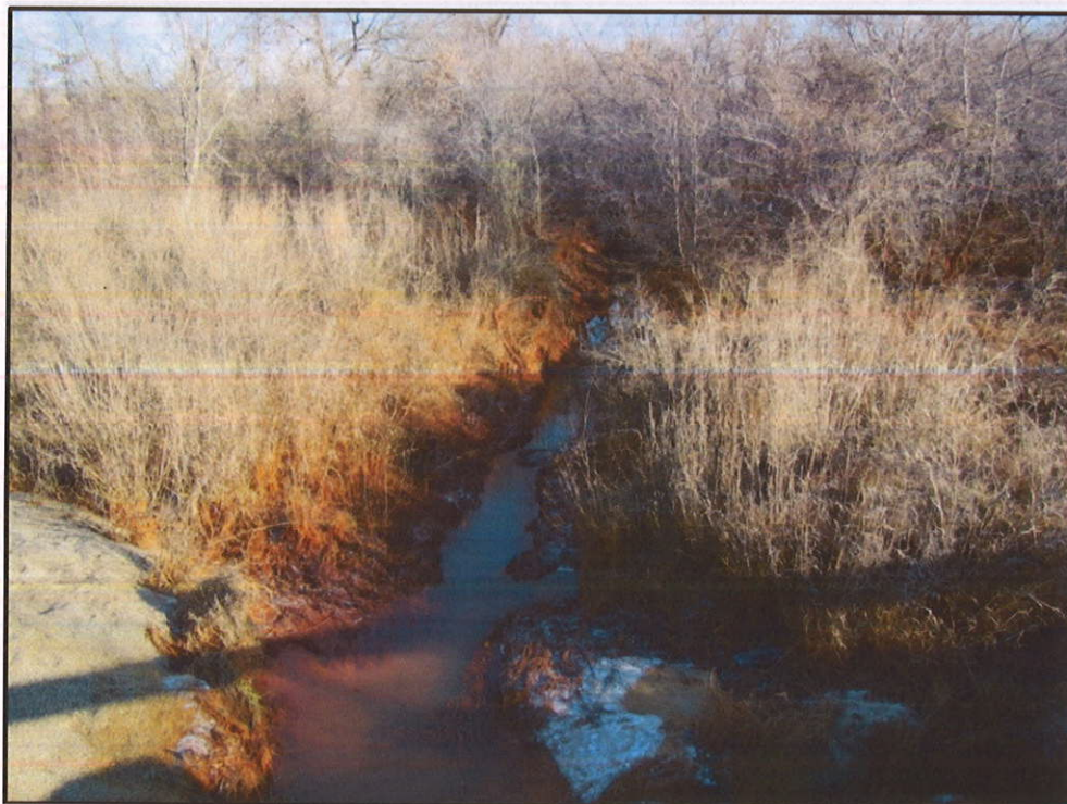
Photo 27: Former Lytle Creek at Douthat Bridge (photo taken facing upstream)