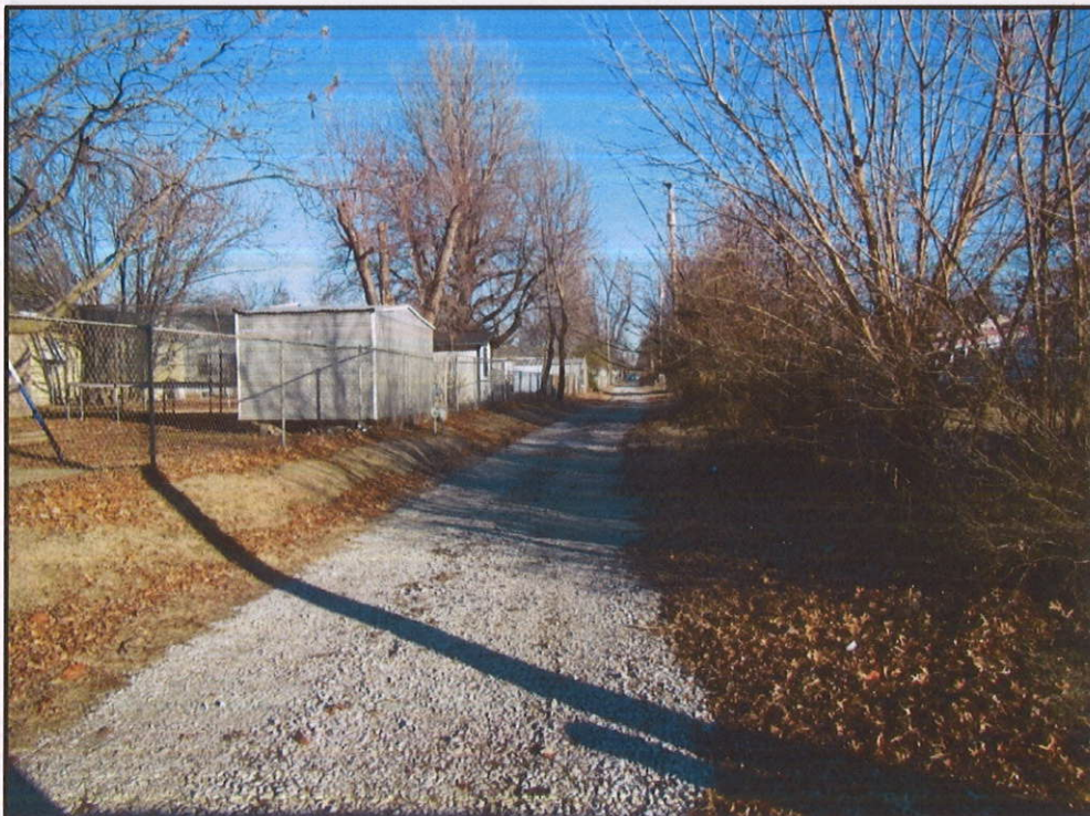
Photo 52: Limestone Alleyway Adjacent to Washington Elementary School