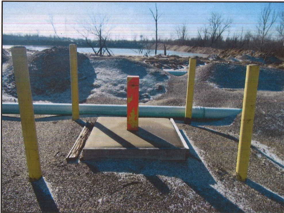
Photo 34: MW-1 at Sooner Pile, Location of Chat Injection Pilot Study