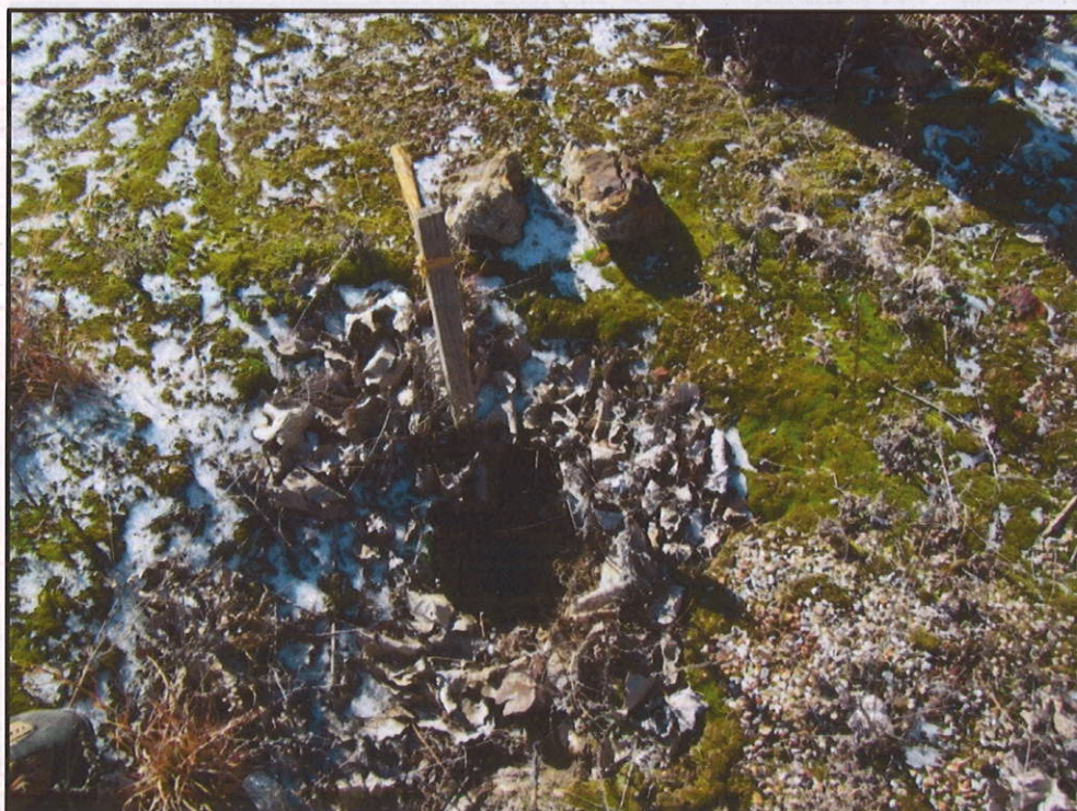
Photo 36: Tulsa Mine Well at Atlas Chat Pile (well was plugged in February 2015)