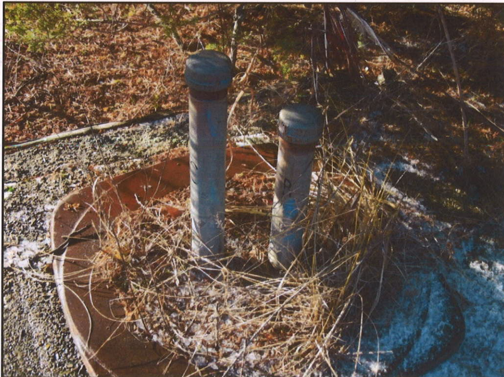
Photo 30: Powerhouse Well in January 2015 (well plugged in February 2015)