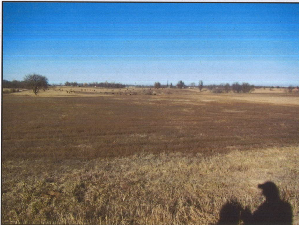
Photo 44: Distal 7 North; Vegetation Has Yet to Become Established