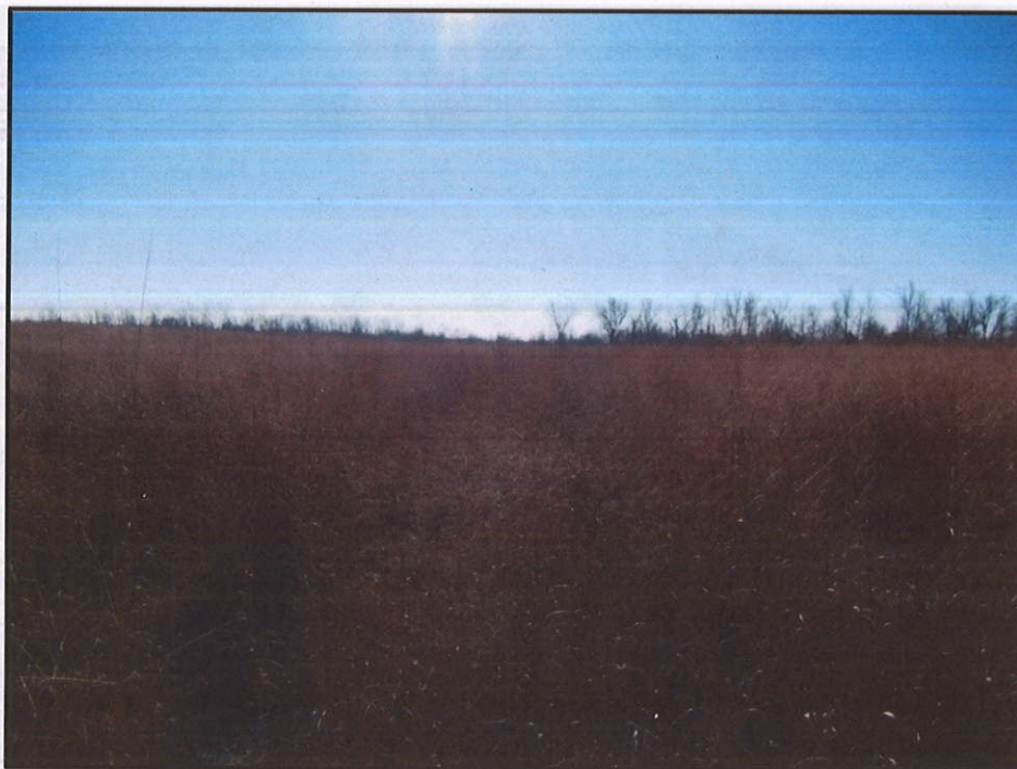
Photo 32: OU2 Repository Formerly Owned by Picher Development Authority; Property Currently Owned by Quapaw Tribe