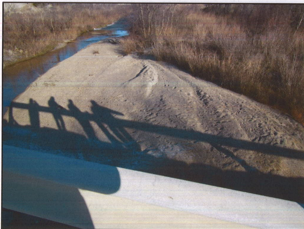
Photo 28: Chat in Tar Creek at Douthat Bridge (photo taken facing upstream)