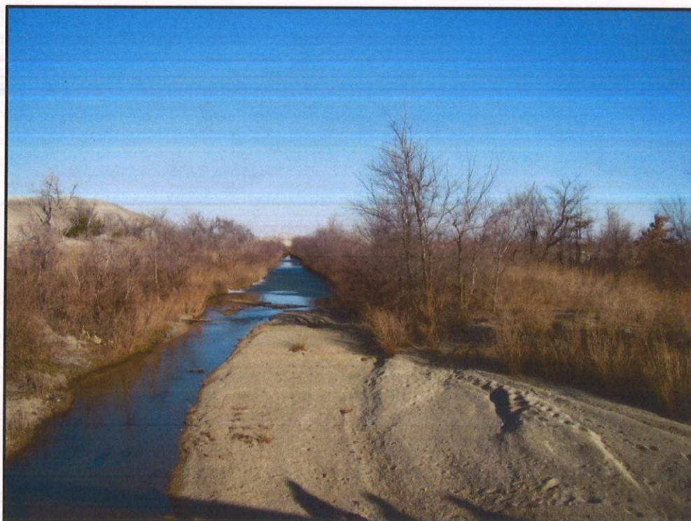
Photo 26: Tar Creek at Douthat Bridge (photo taken facing upstream)