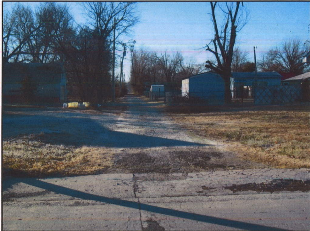
Photo 51: Alleyway Adjacent to Washington Elementary School; No Chat Present