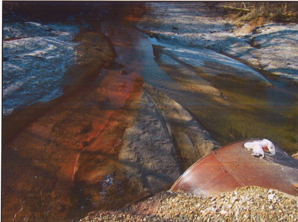
Photo 29: Tar Creek at Douthat Bridge (photo taken facing downstream)