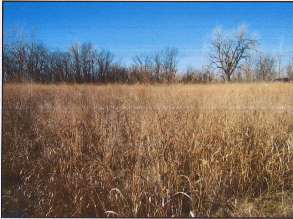
Photo 33: OU2 Repository Formerly Owned by Picher Development Authority; Property Currently Owned by Quapaw Tribe