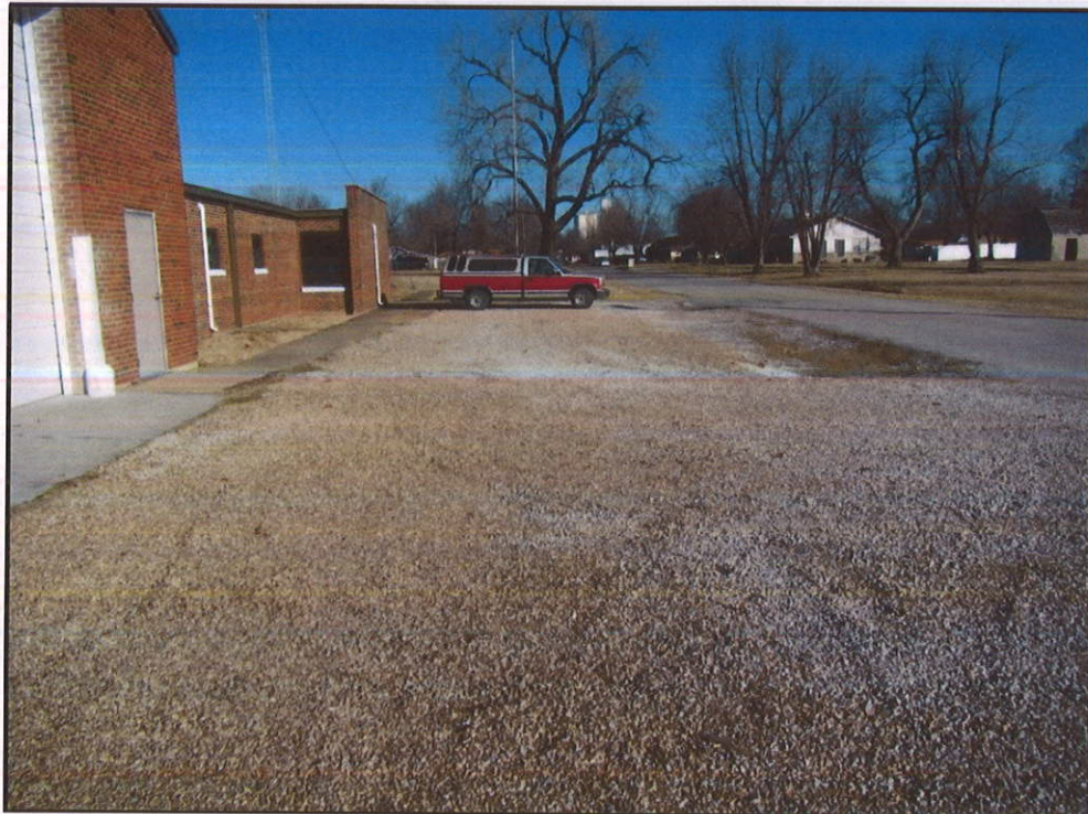
Photo 59: Armory Near Riverview Park; Chat Parking Lot has been Replaced with Limestone