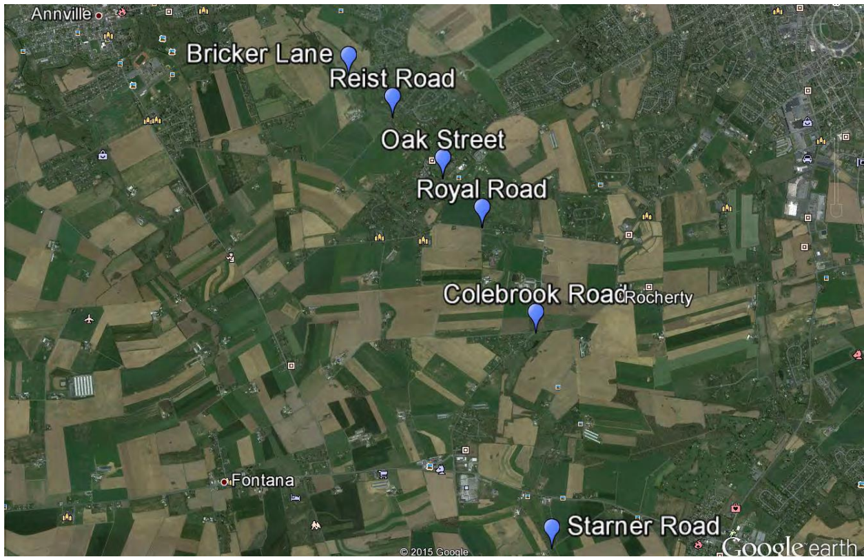
Figure 2: Beck Creek Watershed Ambient Water Quality Sampling Locations

Ambient sampling locations were selected by EPA Region 3, and locations were selected to provide samples that were representative of background conditions within the watershed. Some ambient sampling locations are located at or near an AFO involved in this assessment. Samples were collected at all ambient locations on the same day to ensure comparability of environmental and weather conditions among the ambient samples. The sampling team photographed each ambient sampling location. Photographs were taken to document the sample location, and to document indicators of bed, bank, and ordinary high water mark (OHWM) at each location.