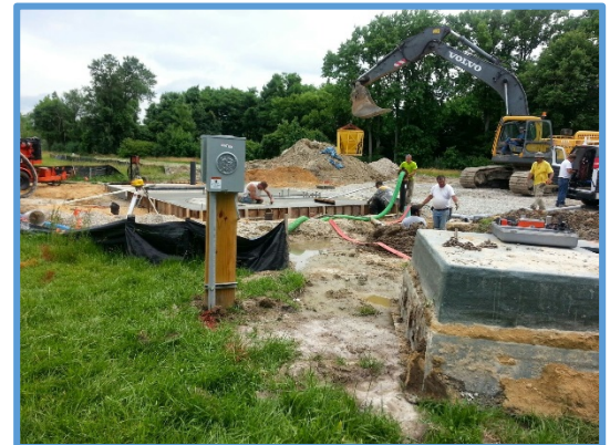
Work to provide mobile home communities with sewer system in Dover.

U.S. Environmental Protection Agency EPA Region 3 Water Protection Division Philadelphia, PA