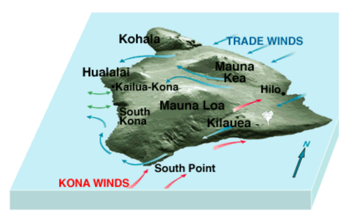
Figure 2. Hawaii wind patterns (from 2015 Demonstration, Figure 2-9).

HDOH submitted the 2015 Demonstration to show that emissions emanating from Kilauea Volcano are natural volcanic exceptional events and that the exceedances summarized in Table 1 and listed in the 2015 Demonstration, Appendix D were caused by these natural volcanic exceptional events.