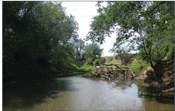
Figure 3. Otter Creek fully supports its warm water aquatic beneficial use.

cover crops, 461 acres of access control, one diversion, 138 acres of ridge-till and 996 acres of strip-till tillage management, 4,100 feet of field border, 150 acres of forage and biomass planting, 211 acres of forage harvest management, one pond, one pumping plant, 486 acres of seasonal residue management, 38.2 acres of improved irrigation efficiency through sprinkler irrigation, 5.5 acres of grassed waterway, 158 acres of nutrient management, 461 acres of range planting, reduced tillage residue and tillage management on 1,566 acres, 216 acres of integrated pest management (IPM), 770 feet of low-pressure underground irrigation pipeline, 158 acres of irrigation water management, and upland wildlife habitat management on 1,007 acres.