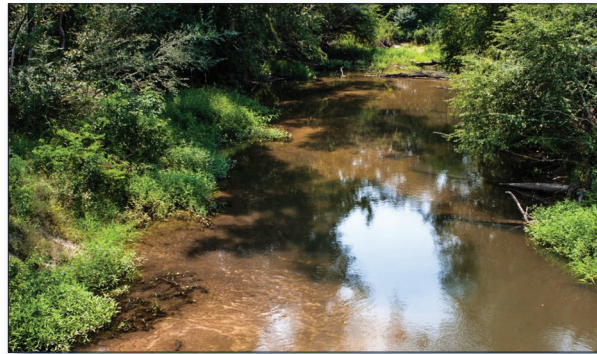
Figure 3. Data were collected at this Big Creek monitoring site.

Since 2008, USDA’s Natural Resources Conservation Service (NRCS) has assisted local landowners in implementing dairy and cattle farm BMPs. In 2012 the Louisiana Department of Agriculture and Forestry (LDAF) partnered with NRCS to continue implementing these BMPs, which included nutrient management (3,659 acres), fencing (463 acres), field borders (89 acres), forage harvest management (617 acres), heavy use area protection (366 acres), irrigation pipeline (144 acres), livestock pipeline (67 acres), livestock shade structure (77 acres), pond (43 acres), prescribed grazing (3,606 acres), residue and tillage management (363 acres), sprinkler system (114 acres), upland wildlife habitat management (150 acres), waste facility closure (77 acres), waste recycling (598 acres), water well (35 acres) and water facility (256 acres). Road signs stating, “Big Creek Watershed: Ours to Protect,” were also placed along roadways throughout the watershed in an effort to raise public awareness.