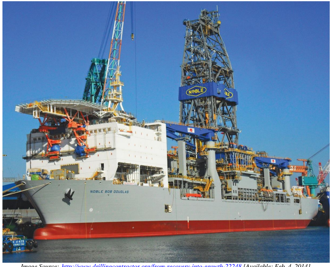
Figure 3-1 Drilling Vessel

six life boat engines (DR-LB-01 through DR-LB-06), sixteen third-party engines (DR-TP-01 through DR-TP-11 and DR-TP-17 through DR-TP-21), five third-party well evaluation engines (DR-TP-12 through DR-TP-16), and eight pump engines on the stimulation vessel (SV-PE-01 through SV-PE-08). The third-party equipment is leased on short notice and the exact specifications are unknown. Anadarko selected equipment with a "worst-case" emissions profile to develop projected emission calculations and impacts, but will identify the exact engines for the purpose of permit compliance and emissions inventory.