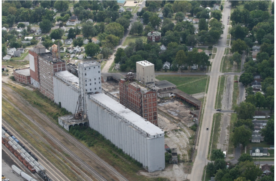
The Pillsbury Mills facility as it looks today.

Site-related documents may also be viewed at the Lincoln Library.