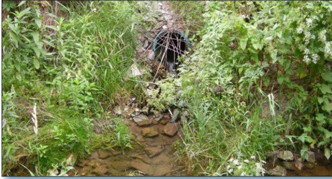
Figure 2. Subsurface drainage tile in Wilson Rhodes Ditch, part of Flowers Creek watershed.

plan for the Middle Eel River and its tributaries, promoting and implementing a cost-share program for BMPs, and conducting water quality monitoring and public outreach. The university hired a watershed coordinator and formed a steering committee to lead development of the watershed management plan. Implementation efforts began after the watershed management plan was completed in early 2011.