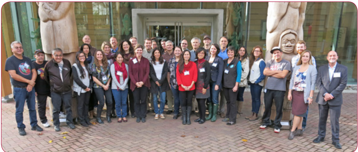
Participants in November LEO workshop in Victoria, B.C.

To learn more about the LEO network, go to http://bit.ly/2gffo9n .