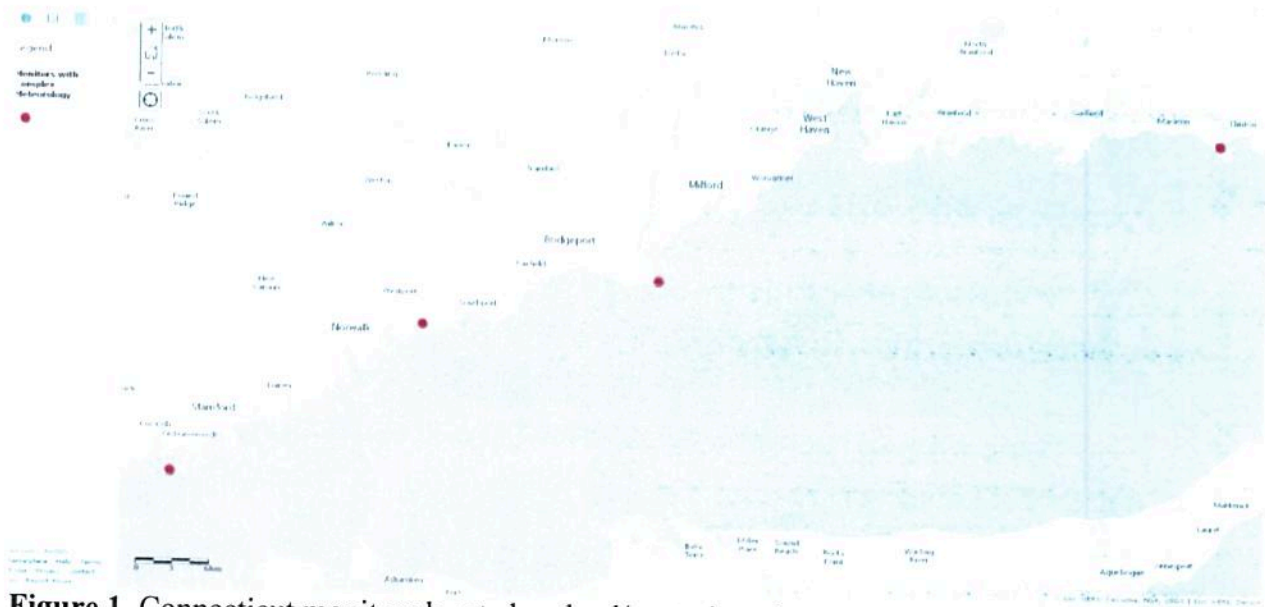
Figure 1. Connecticut monitors located on land/water interface.