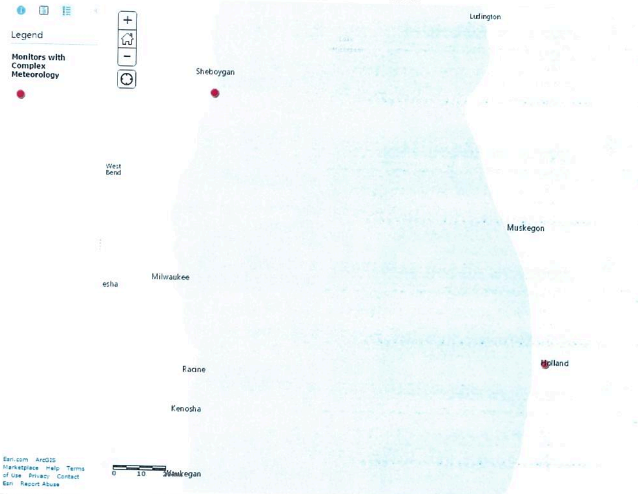
Figure 2. Wisconsin and Michigan monitors located on land/water interface. 3