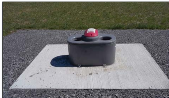
Figure 3. Alternative water tank installed in Stokes County.