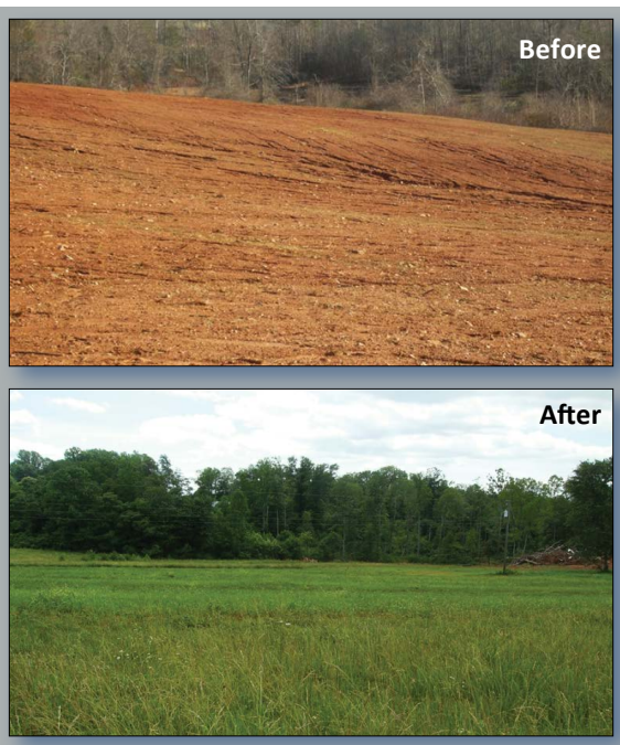
Figure 4. A farm field, before (top) and after (bottom) a cropland conversion BMP was applied.