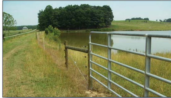
Figure 2. Livestock exclusion fences installed in Rockingham County.

The water quality improvement in the Dan River can be attributed to many stakeholders active in the restoration effort throughout the watershed, including the EPA, North Carolina Department of Environmental Quality DWR, North Carolina Agricultural Cost Share Program, and county landowners. A combined total of $1,104,883 has been invested in the watershed with a portion of EPA CWA section 319 funding ($694,900) directed towards plan development and BMP implementation.