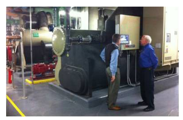
Between 2011 and 2013, Hyatt modernized and optimized its chiller and boiler plants.

Between 2011 and 2013, Hyatt Regency Atlanta improved water and energy efficiency in its chiller and boiler plants, reducing energy use by 10.6 percent. Optimizing a chiller system for energy efficiency reduces the heating load on the cooling tower, which means that less water needs to be evaporated to dissipate the reduced heat load. Likewise, energy efficiency in the boiler system results in water efficiency. Optimizing these two systems allowed Hyatt Regency Atlanta to reduce water and energy use, contributing to its overall 36 million gallons of water savings in 2013 alone.