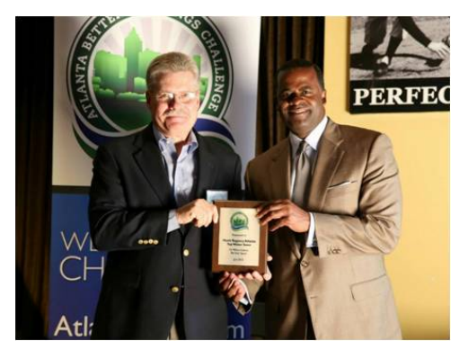
Hyatt Regency Atlanta received the Atlanta Better Buildings Challenge "Top Water Saver" award.