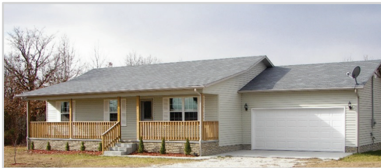
A WaterSense labeled home in Harrison, Arkansas, built through NWRHA's Mutual Self-Help Housing Program.

Since joining WaterSense in October 2014, Northwest Regional Housing Authority (NWRHA) in Arkansas has brought water and energy savings down south by building 25 WaterSense labeled homes—and doesn't plan to stop. The homes are part of NWRHA's Mutual Self-Help Housing Program, which helps low-income participants across 10 Arkansas counties achieve the dream of home ownership through "sweat equity." During the program, funded in part by U.S. Department of Agriculture Rural Development , six to eight participants work together with construction supervision to simultaneously build their own houses along with those of their fellow participants. That labor contribution establishes equity in the home for move-in day, which happens only after all houses in the group are complete.