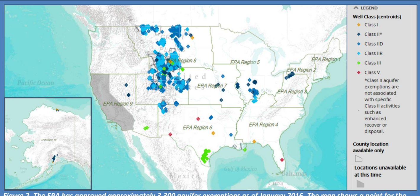
Figure 2. The EPA has approved approximately 3,300 aquifer exemptions as of January 2016. The map shows a point for the center of each aquifer exemption or a county outline for those exemptions with imprecise locational information. Points are color coded by the class of injection well proposed to inject into the exempted aquifer. Locations of aquifer exemptions in California will be updated as information becomes available.

should have requested an exemption for Class II wells injecting oil and gas-related fluids.