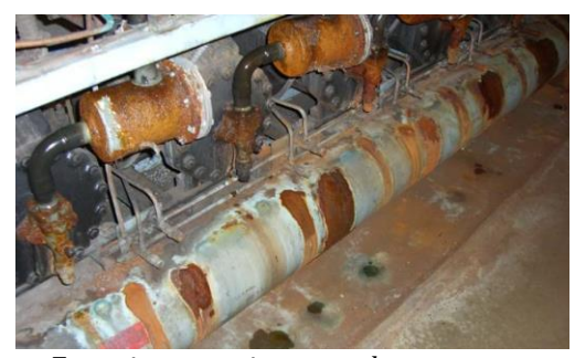
Excessive corrosion on rack components

❖ Do any of my system components need upgrades? Some existing system components may need to be replaced with parts that are more leak-resistant (e.g., suction stepper valves, loop piping systems, and remote manifolds). Such components may cost more upfront, but can save money overtime.