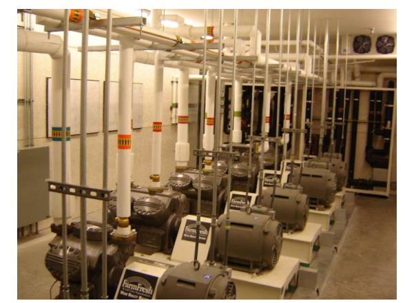
Clean machine room at a Farm Fresh store

environment for service technicians. Dirty refrigeration compressor racks, condensers, remote headers, and walk-in evaporator coils make it difficult for technicians to spot leaks. Compressor racks and their components should be free of oil and dirt. In addition, corrosion on steel components should be removed and components painted with a rust-inhibiting paint to help prevent future corrosion. Equipment should be thoroughly cleaned once a year, or more frequently in response to the accumulation of oil and dirt.