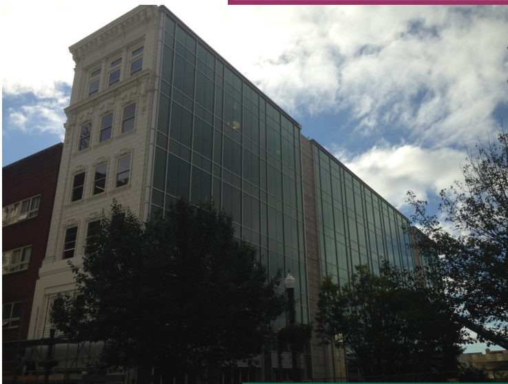
Exterior of the Trifecta Building

"I strongly believe that redevelopment of vacant or underutilized property can not only be a cultural asset for a community but can also change the direction of that community," said Jeff Brown, principal with Charles Street Capital.