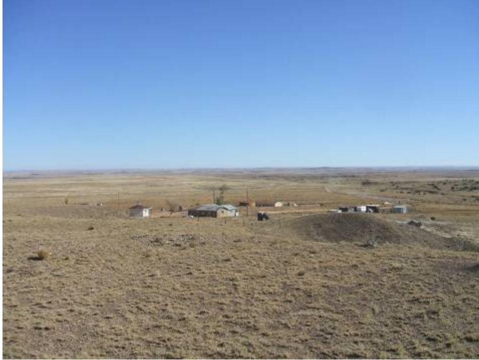
Photo 3. Standing Rock mine site and housing compound approximately 50 feet north of site, towards the north