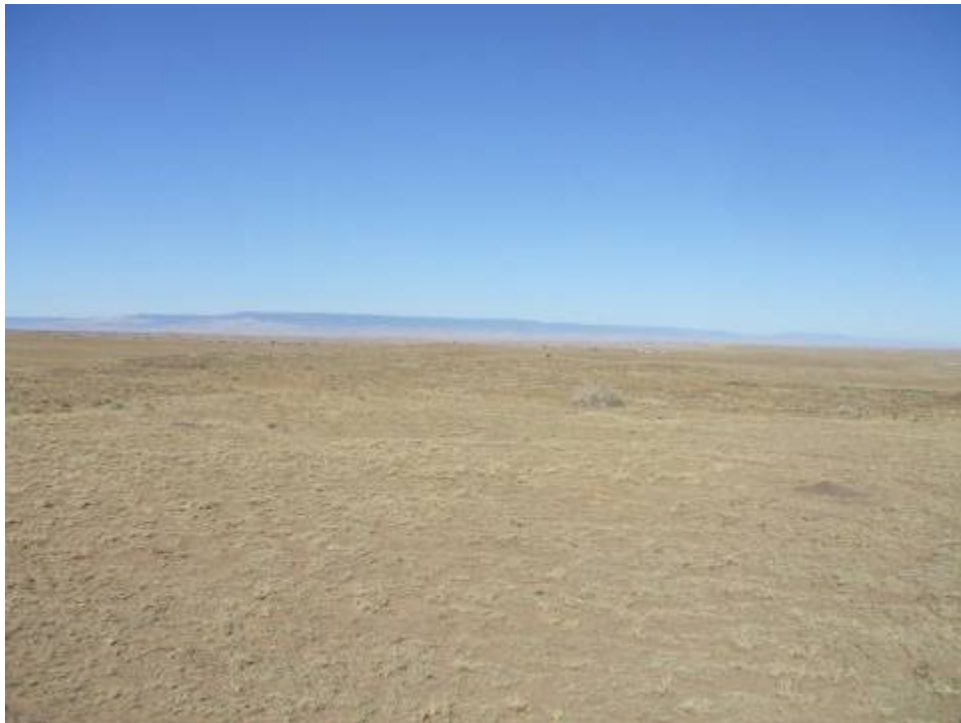
Photo 2. Standing Rock mine site, towards the west