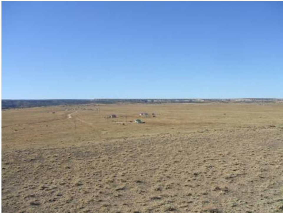
Photo 4. Standing Rock mine site and housing compound approximately 0.25 miles south of site, towards the south