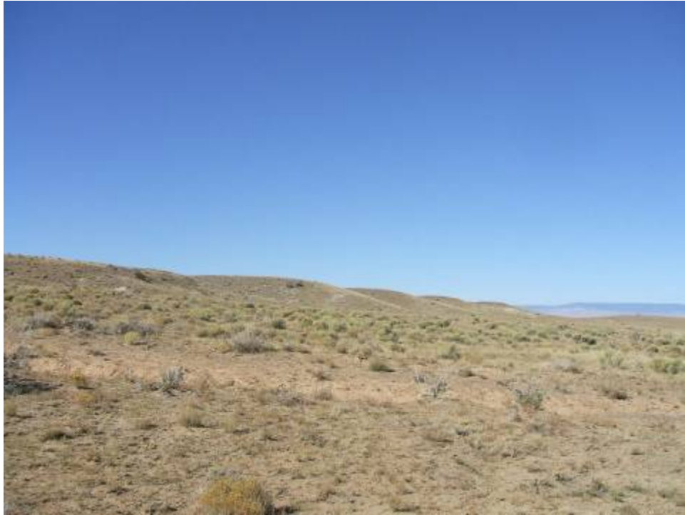
Photo 1. Standing Rock mine site, towards the southwest