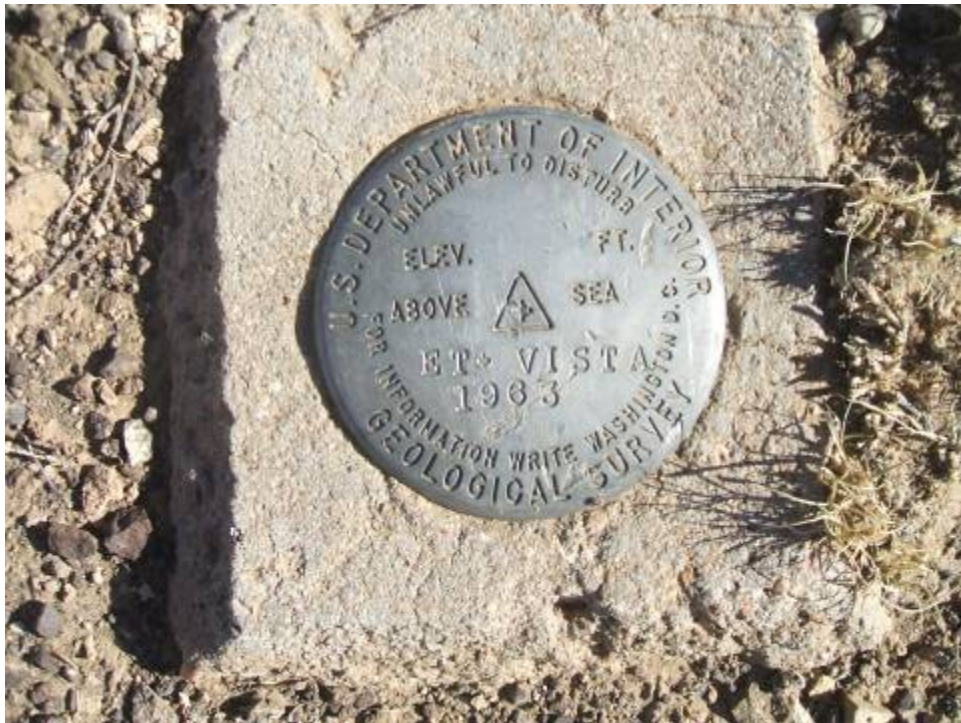
Photo 6. Standing Rock mine site geological survey point in the eastern portion of the site