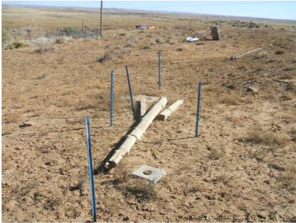
Photo 9. Wells located in northern housing compound, directly northeast of mine site, towards the north