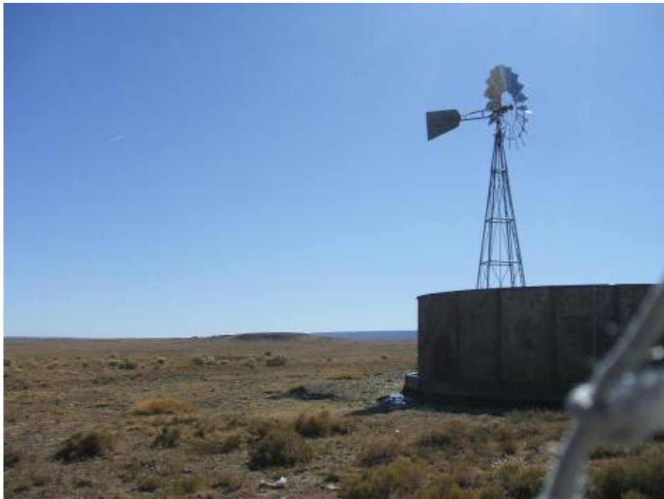
Photo 14. Windmill well approximately 1.5 miles west of mine site, towards the east