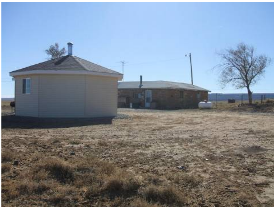
Photo 10. Housing compound directly north of mine site, towards the northeast