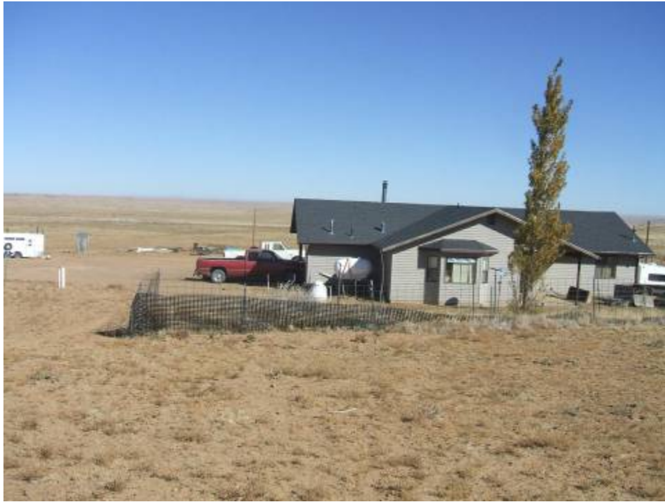
Photo 11. Housing compound directly north of mine site, towards the north