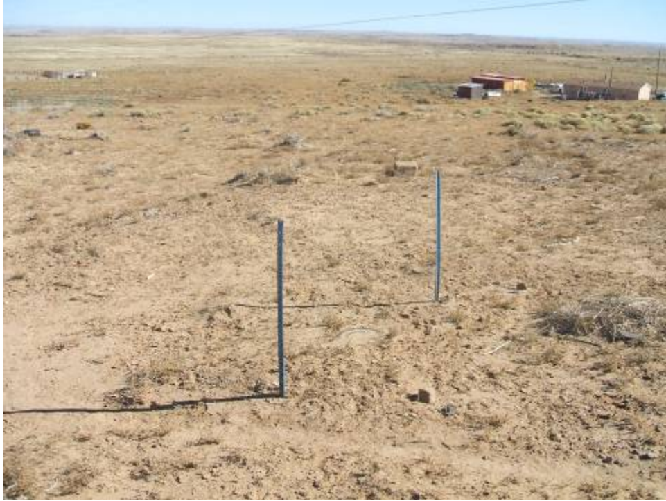
Photo 13. Well located in northern housing compound, directly northeast of mine site, towards the north