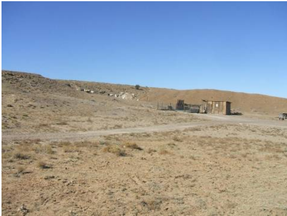
Photo 12. Wooden structure and sheep herd at housing compound directly north of mine site, towards the southwest