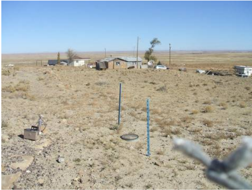
Photo 7. Standing Rock mine site well at eastern end of the site, towards the north