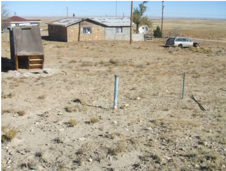
Photo 8. Well located in northern housing compound, directly northeast of mine site, towards the north