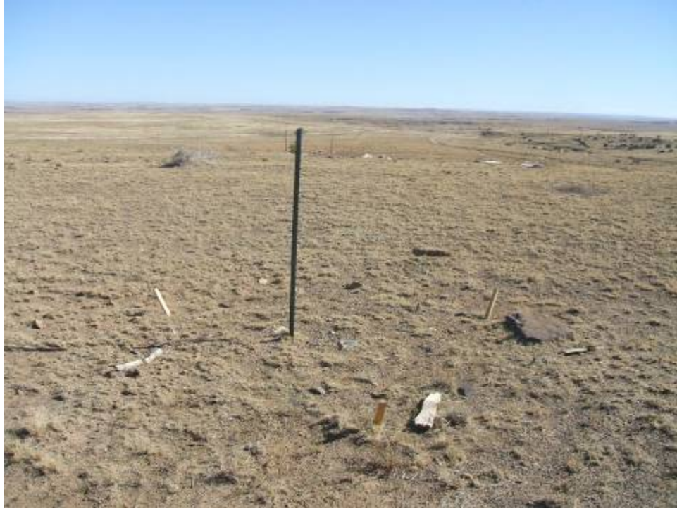
Photo 5. Standing Rock mine site geological survey point in the eastern portion of the site, towards the north