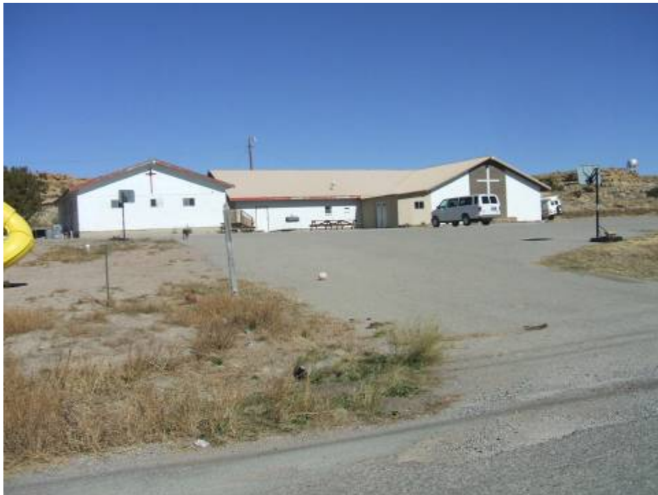
Photo 10. Church at northeast corner of site, towards the northeast