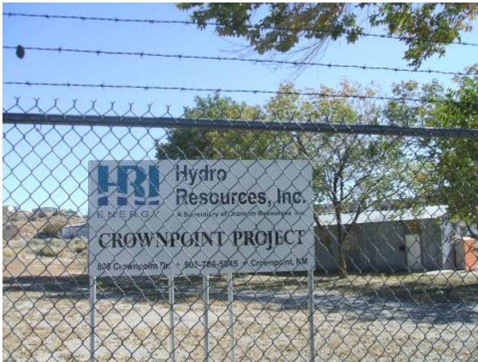
Photo 2. Crownpoint ISL mine site, current business operating onsite – “Hydro Resources, Inc”, towards the south