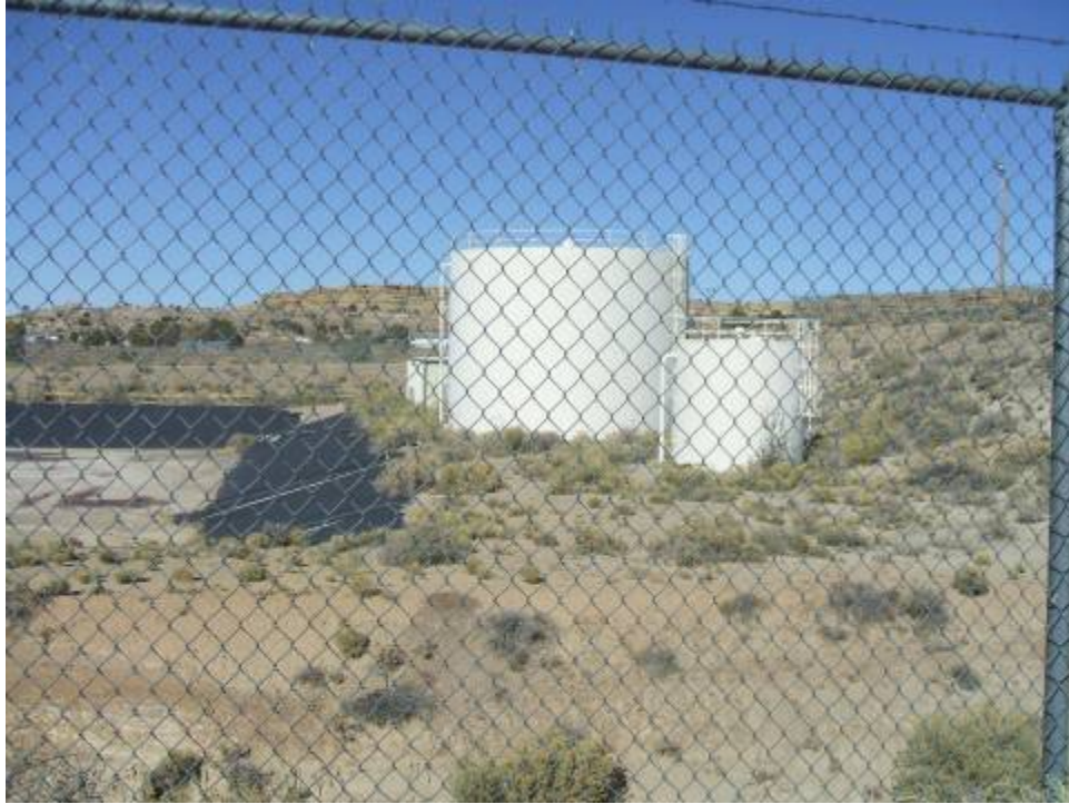
Photo 5. Crownpoint ISL mine site lined ponds and tanks, towards the northwest