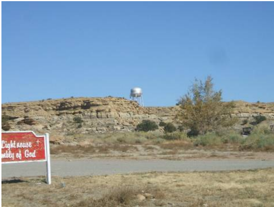
Photo 8. Water tower approximately 0.5 miles north/northeast of site, towards the northeast