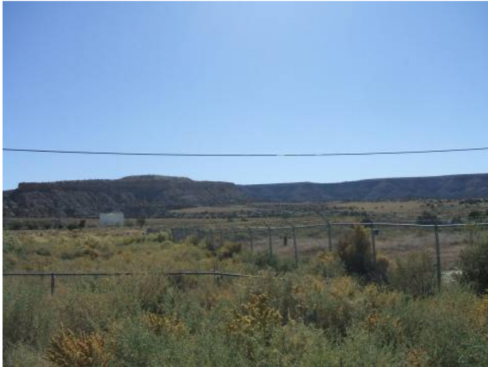
Photo 3. Crownpoint ISL mine site, towards the south