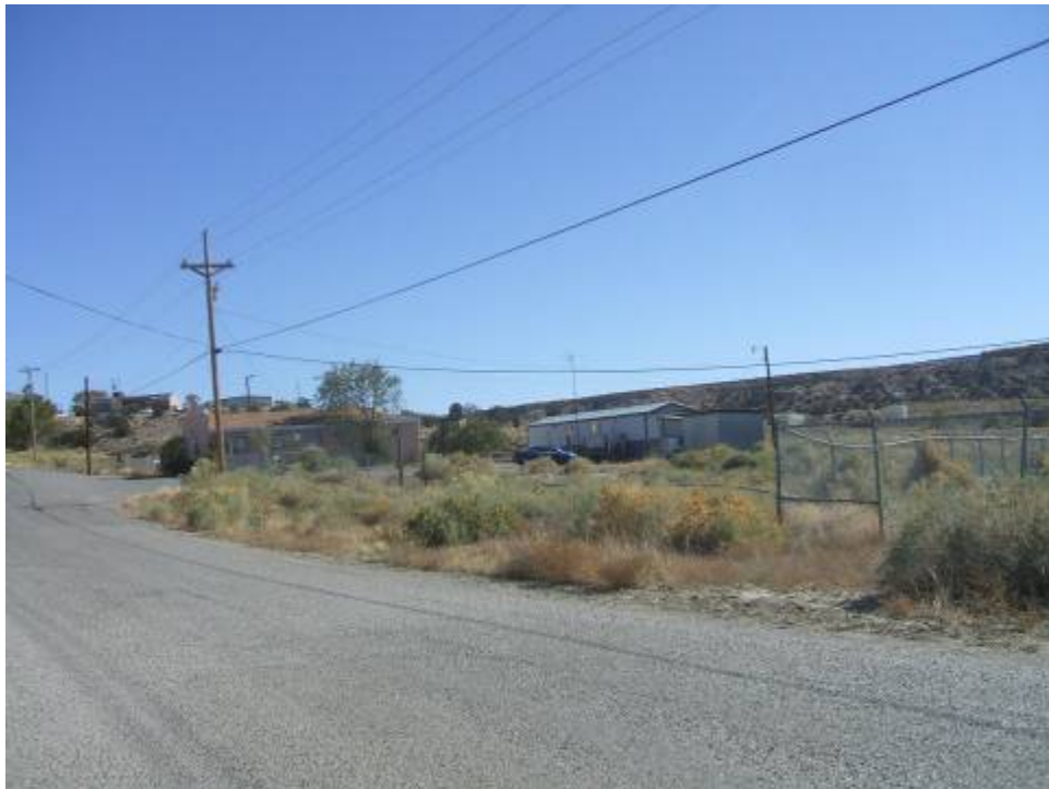
Photo 12. Trailers and houses at northeast corner of site, towards the southeast