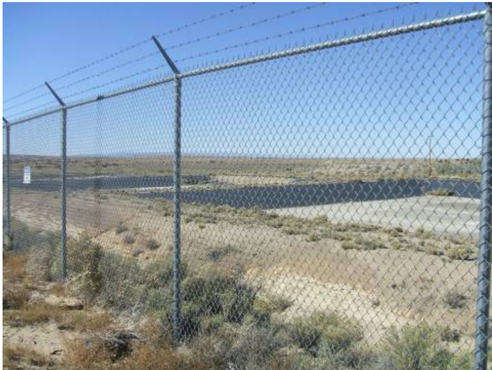
Photo 4. Crownpoint ISL mine site lined ponds, towards the northwest