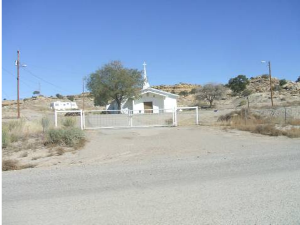
Photo 9. New Life Fellowship Church, approximately 200 feet north of site, towards the north