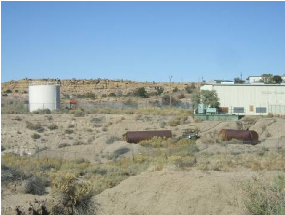
Photo 6. Crownpoint ISL mine site tanks and Hydro Resources building, towards the north