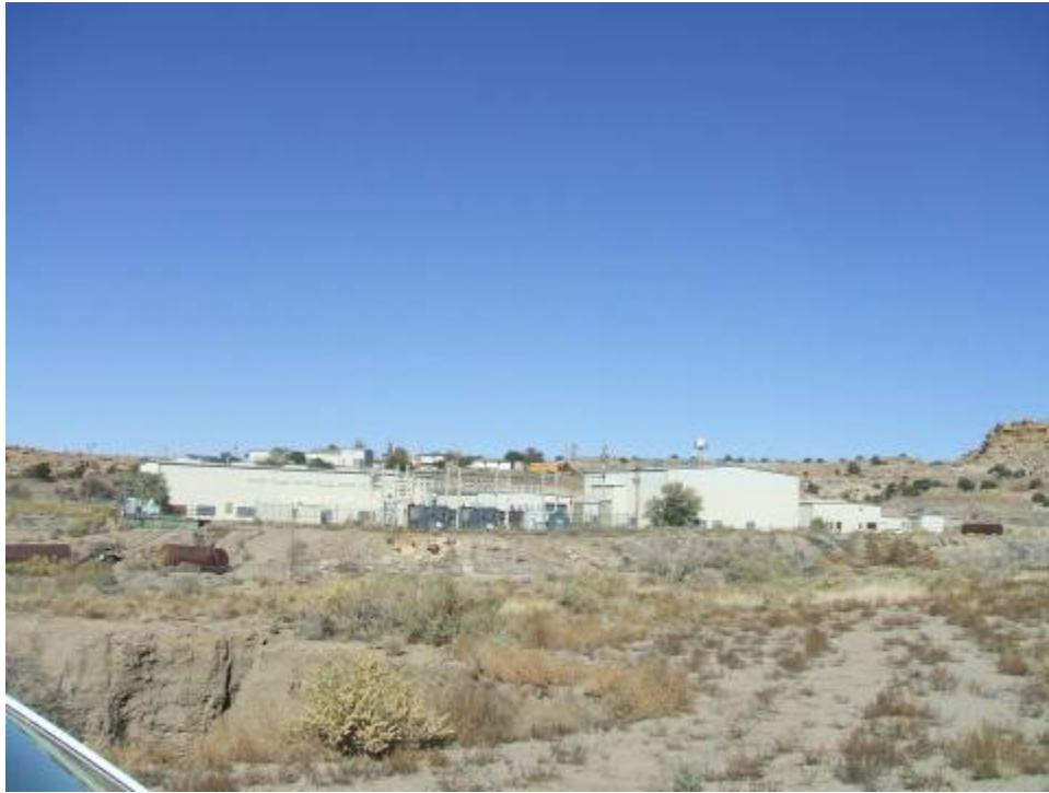
Photo 7. Crownpoint ISL mine site and Hydro Resources building, towards the north