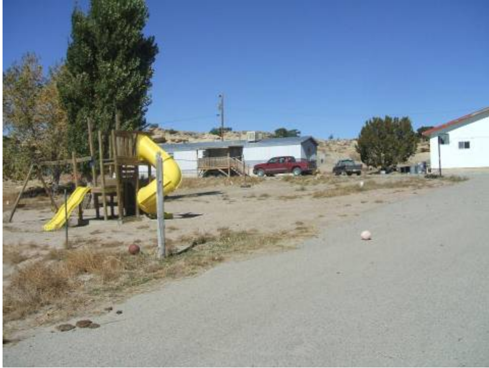
Photo 11. Trailer and church at northeast corner of site, towards the northeast