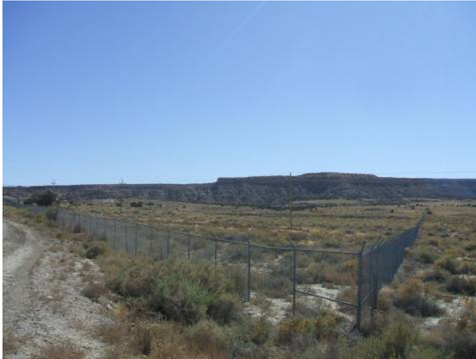
Photo 1. Crownpoint ISL mine site, towards the southeast