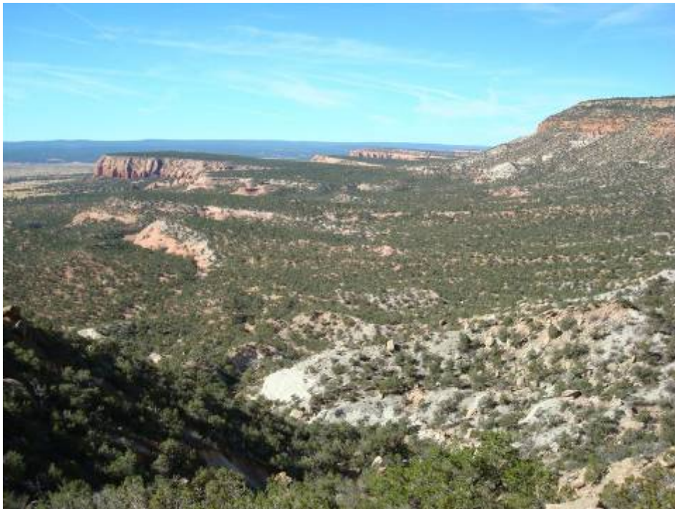
Photo 6. Reynolds Mine site, view towards southwest