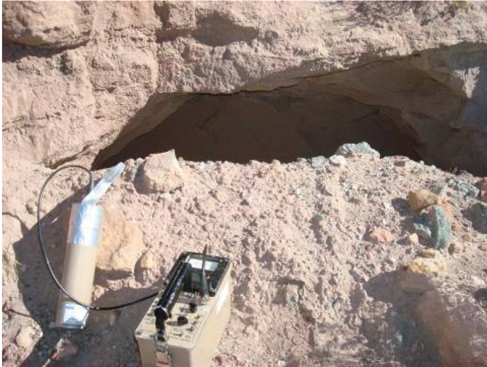
Photo 5. Reynolds Mine site, partially buried adit