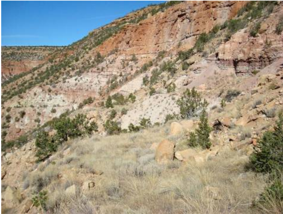
Photo 1. Reynolds Mine site, towards the northwest