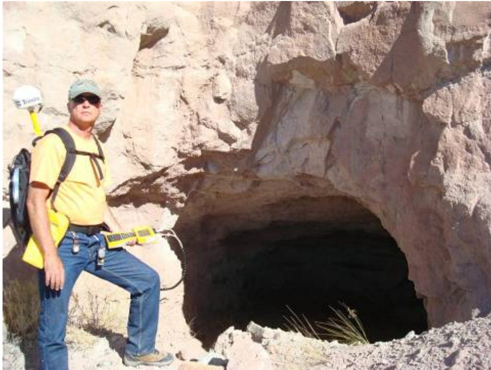
Photo 3. Reynolds Mine site, possible sealed adit