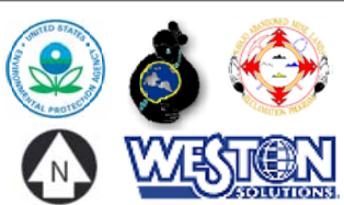
Gamma Radiation Measurements Reynolds Smith Lake Chapter Navajo Nation, New Mexico