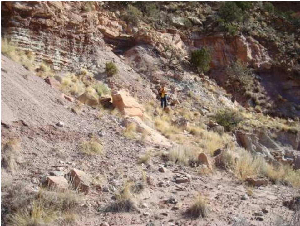
Photo 2. Reynolds Mine site, towards the southeast