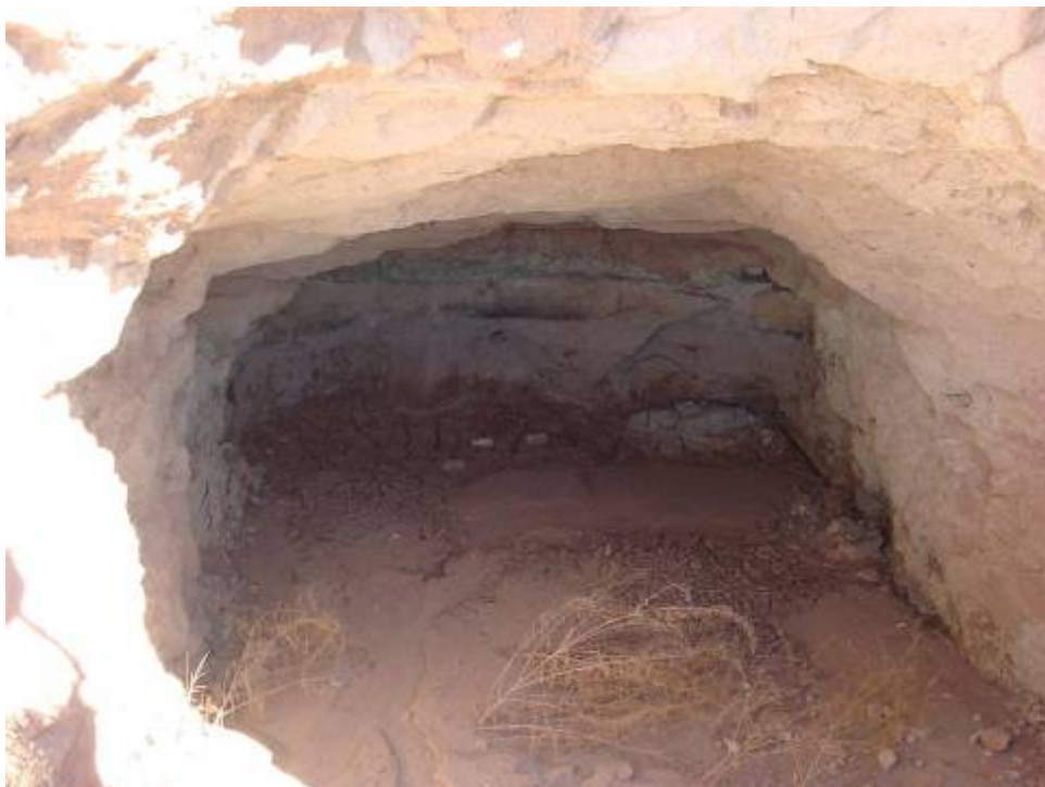
Photo 4. Reynolds Mine site, possible sealed adit