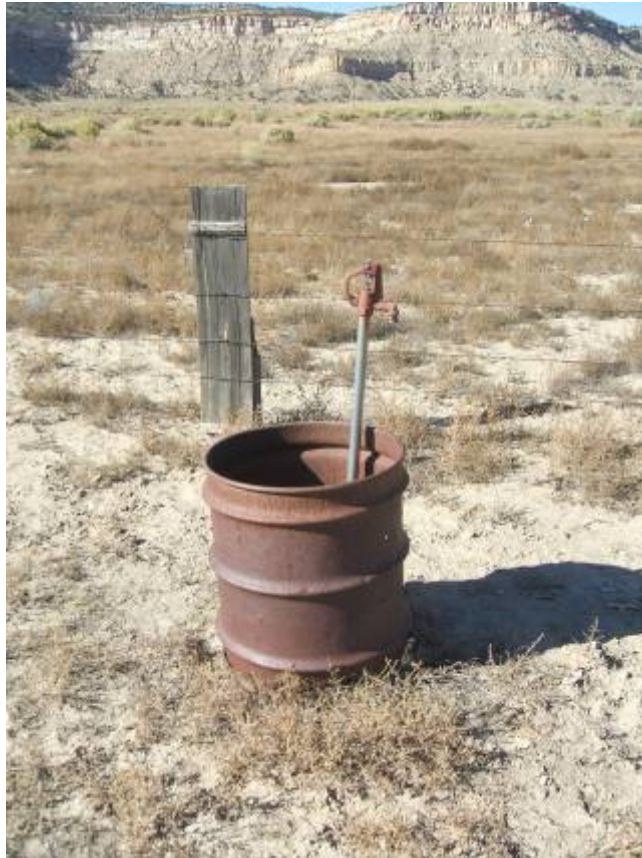
Photo 9. Water pump found along the western edge of the site, towards the west