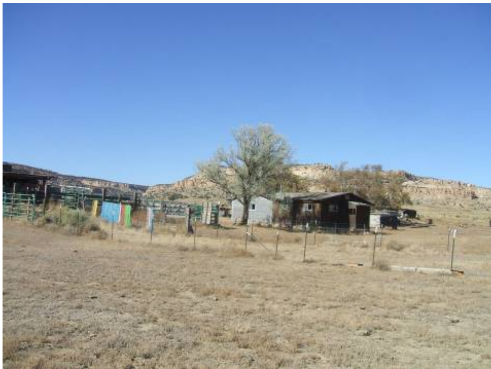
Photo 6. Housing complex located along the western edge of the property, towards the west