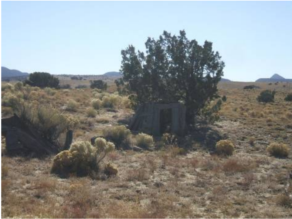
Photo 7. Small wooden structure found within the central western area of the mine site, towards the east