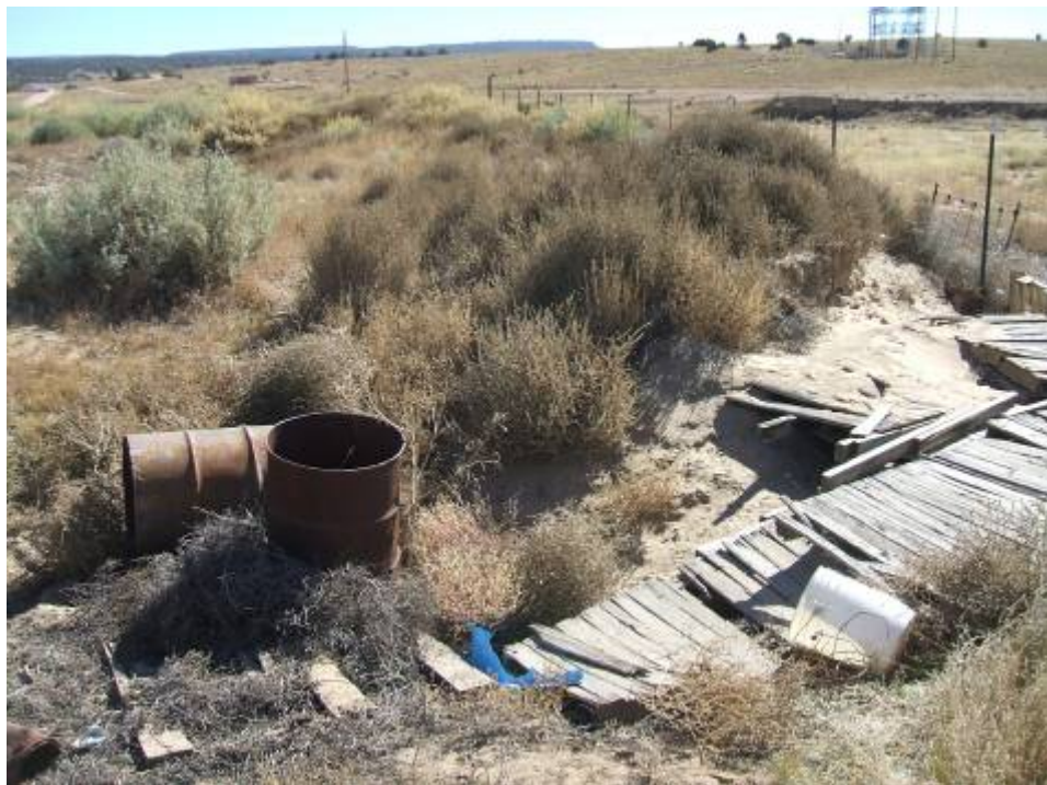
Photo 4. Empty drums and wooden boards found along the southern edge of the site, towards the south