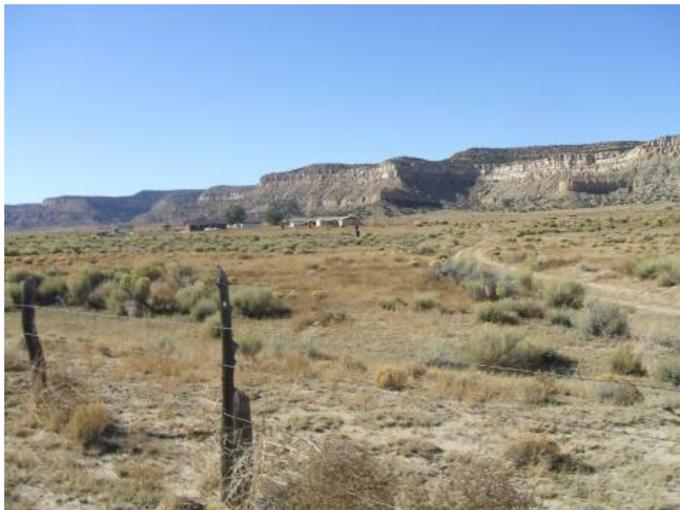
Photo 8. Housing complex located approximately 200 feet west-northwest of the mine site, towards the west