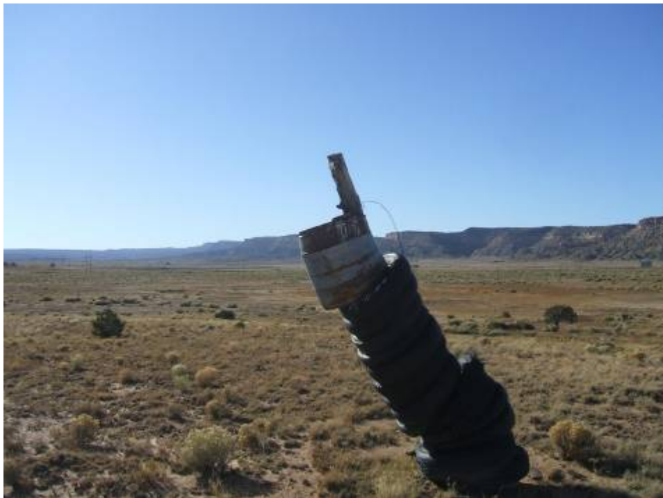
Photo 10. Wooden pole with tires and metal sheeting found in the center of the site, towards the south