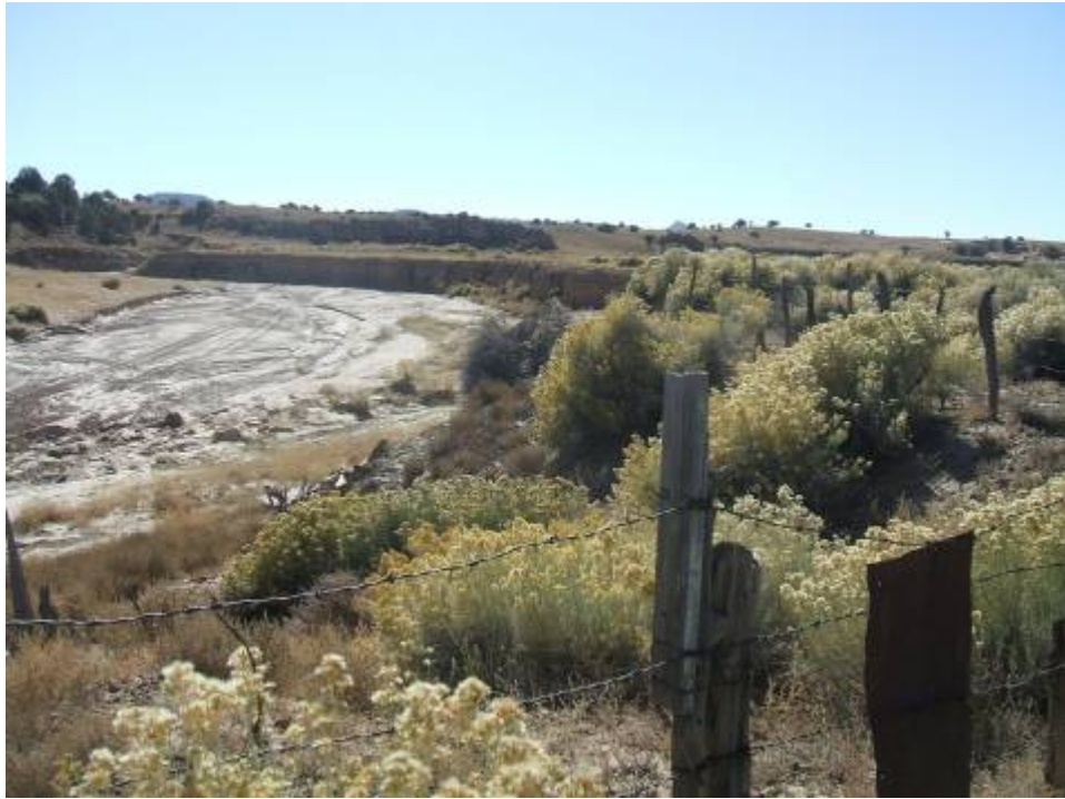
Photo 5. River bed / wash area along the eastern edge of the site, towards the southeast