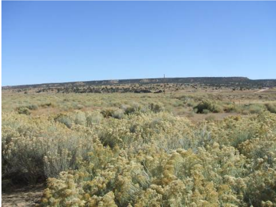
Photo 1. Section 16 Deposit site, towards the east