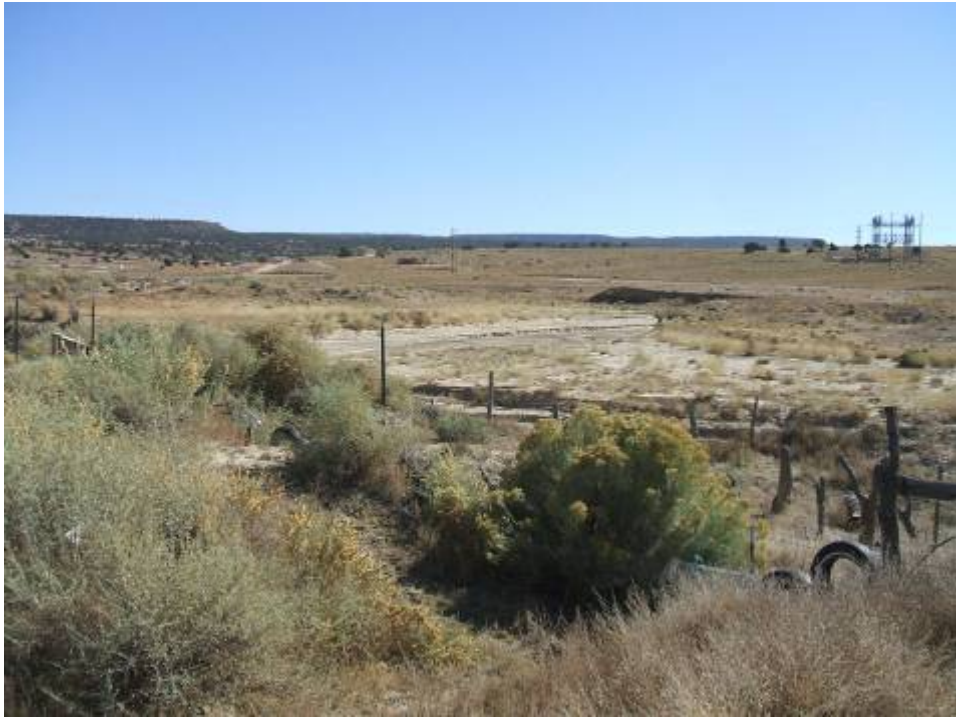
Photo 3. River bed / wash area along the southern edge of the site, towards the southeast