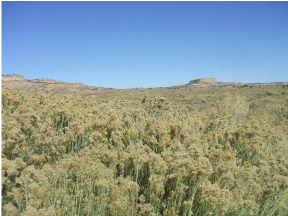
Photo 2. Section 16 Deposit site, towards the north