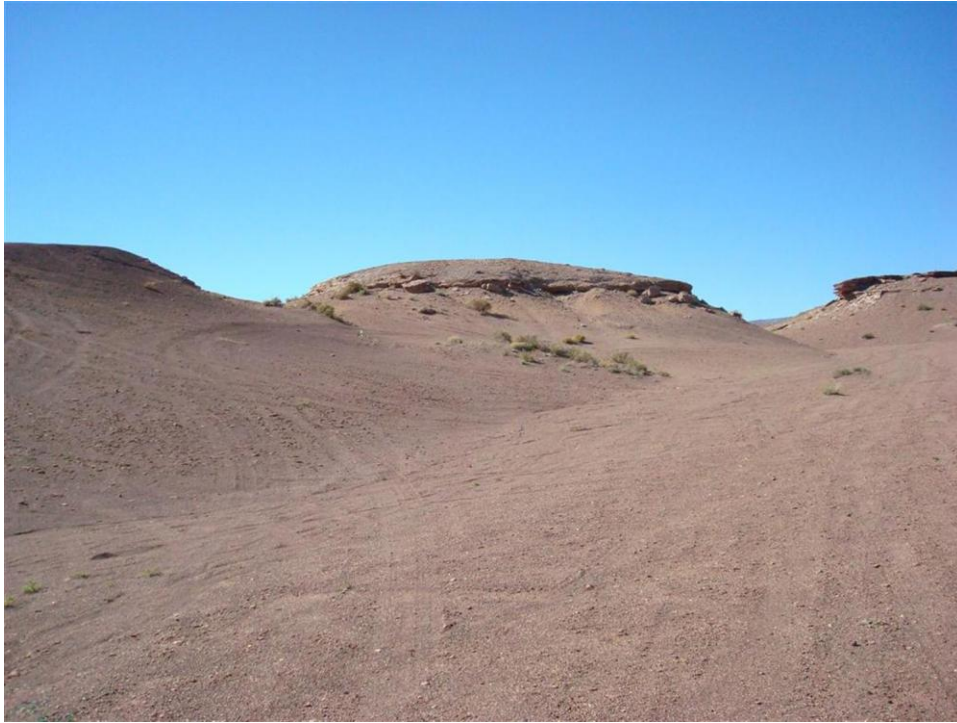
Photo 1. A & B No. 2 mine site