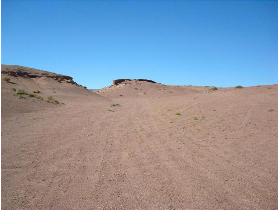
Photo 3. A & B No. 2 mine site