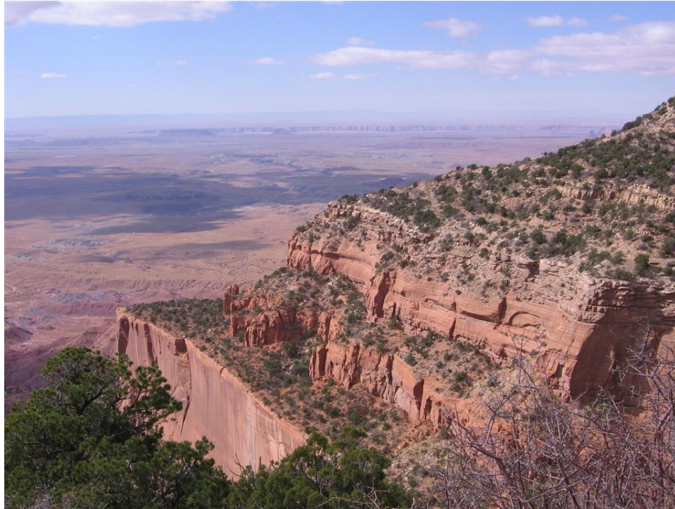
Photo 3. Direction towards mine site