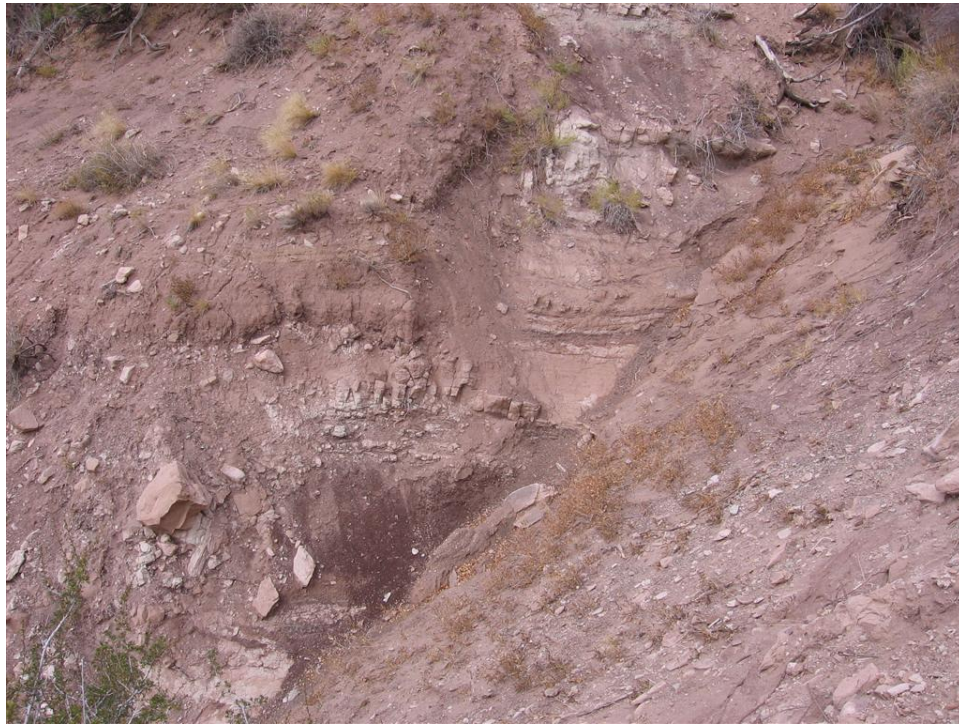
Photo 1. Walking pathway towards mine site washed out