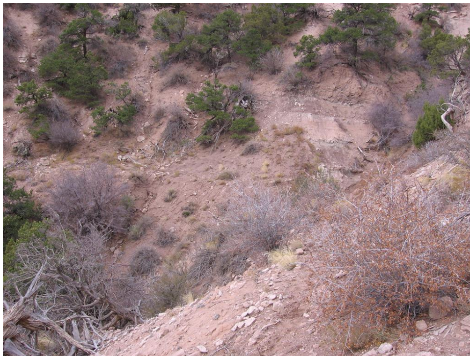
Photo 2. Steep grades towards mine site