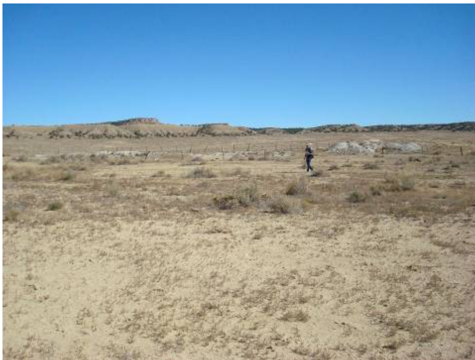
Photo 2. Section 32 Mine site, towards the south east. waste piles in background are located on adjoining Section 33 Mine site