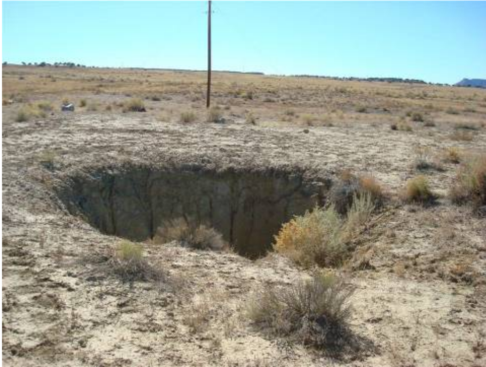
Photo 3. Section 32 Mine site, unsecured open shaft located in south east portion of site