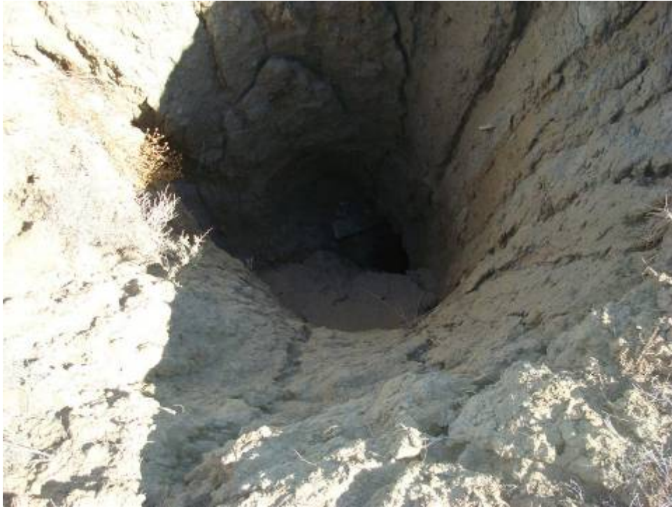
Photo 4. Section 32 Mine site, interior of open shaft