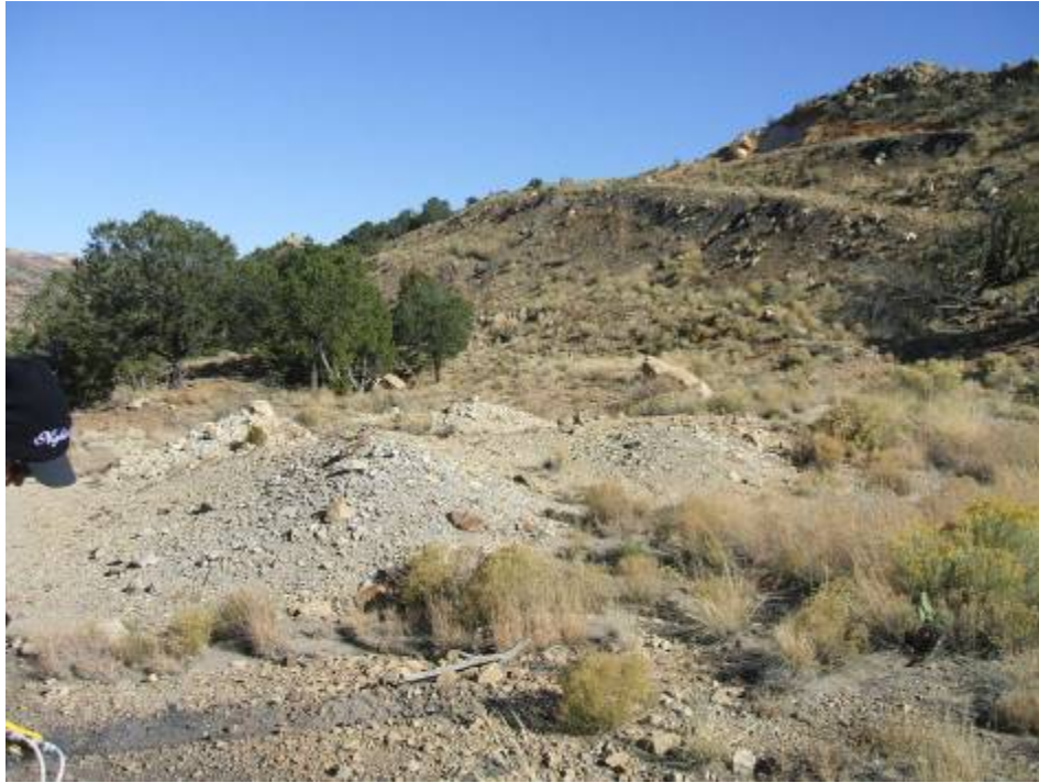
Photo 1. Hogback No 4 mine site and grading, towards the north