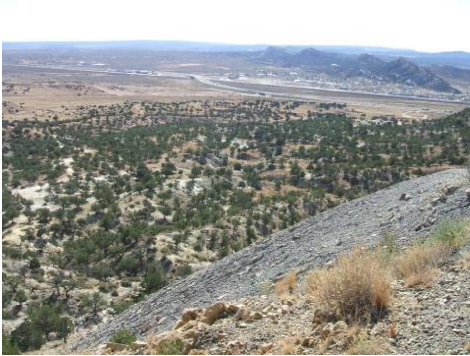
Photo 3. Hogback No 4 mine site southern gravel slope, Gallup in the distance, towards the southeast