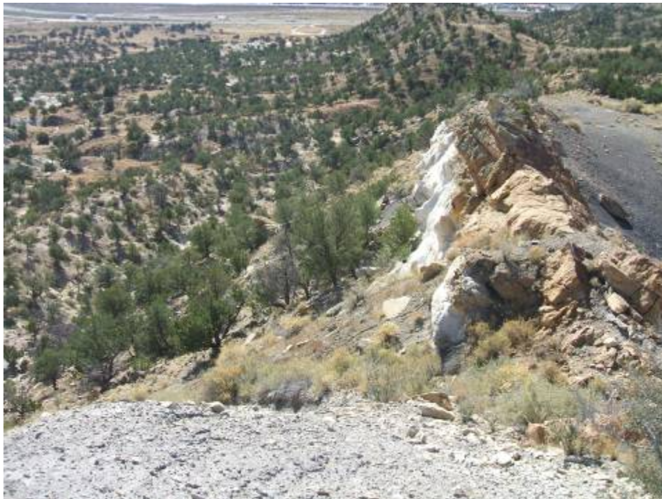
Photo 4. Hogback No 4 mine site cliff area, towards the south