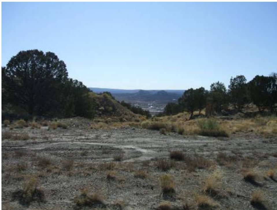
Photo 2. Hogback No 4 mine site, area with dark soil, towards the southeast