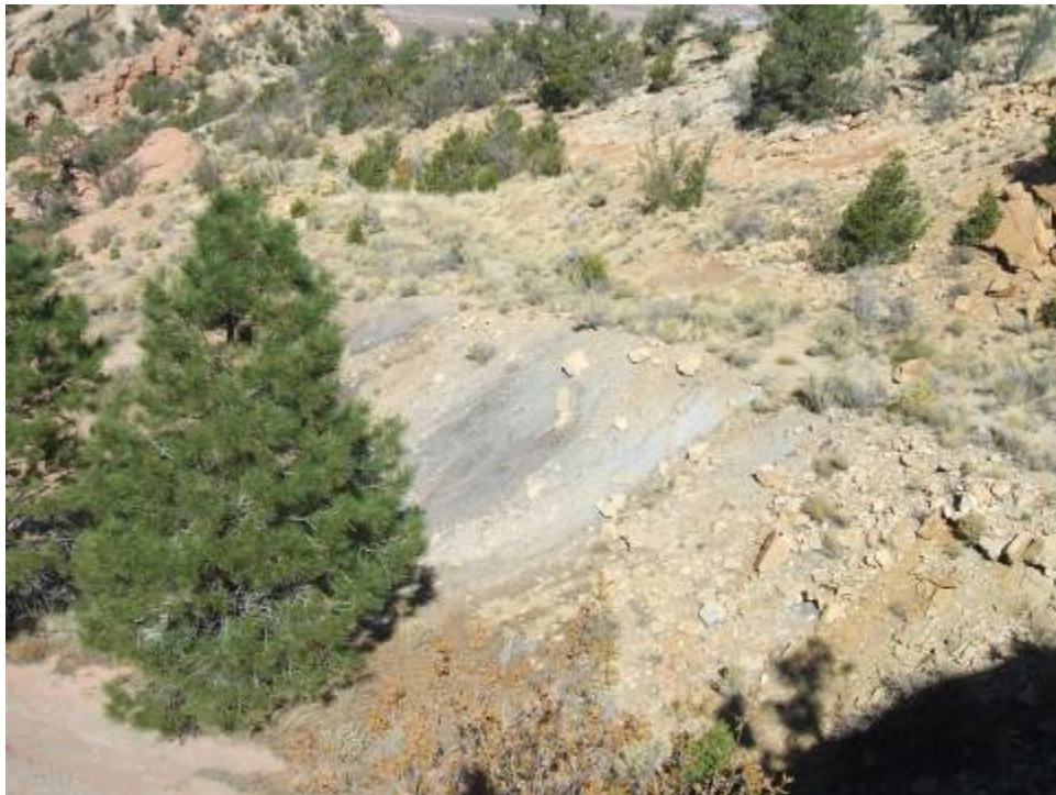
Photo 6. Eunice Becenti mine site, gravel and mudslide area, towards the north