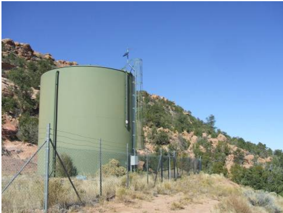
Photo 2. Eunice Becenti mine site, water tank at base of hill, approximately 0.25 miles south of site, towards the northwest