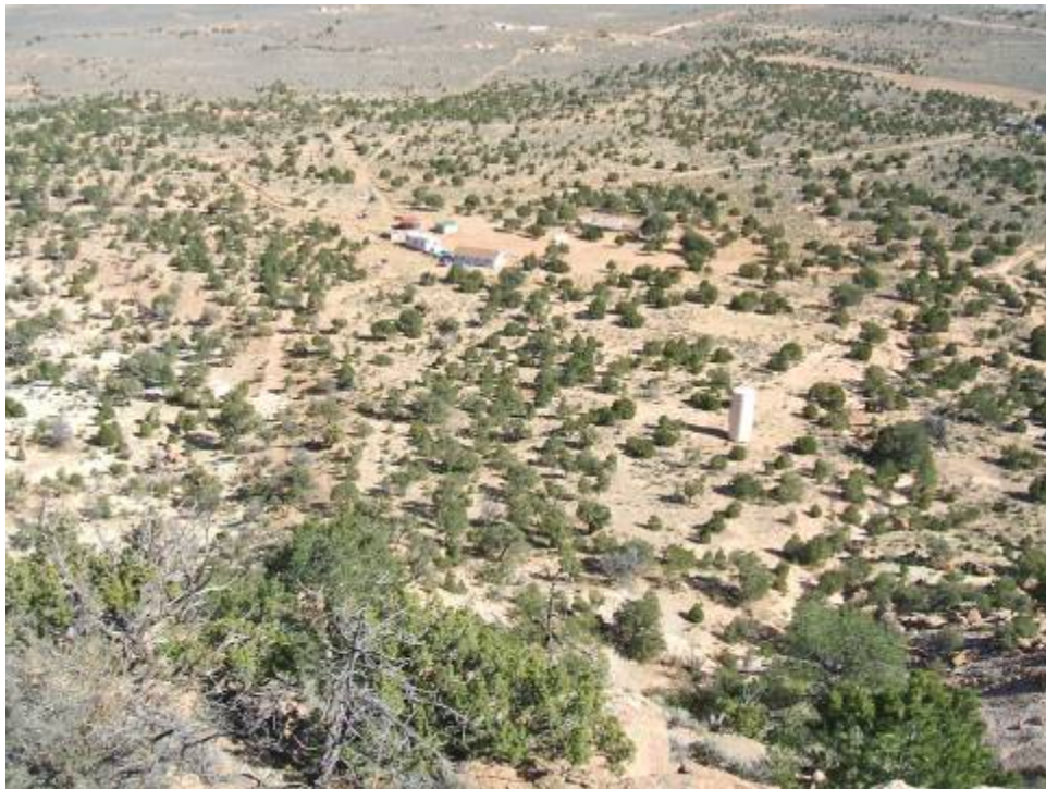
Photo 4. Eunice Becenti mine site, housing compound and water tank approximately 0.25 miles northeast of site, towards the northeast