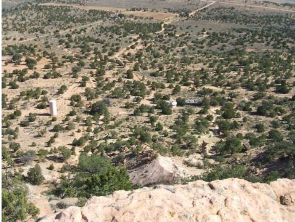
Photo 5. Eunice Becenti mine site, housing compound and water tank approximately 0.25 miles east of site, towards the east