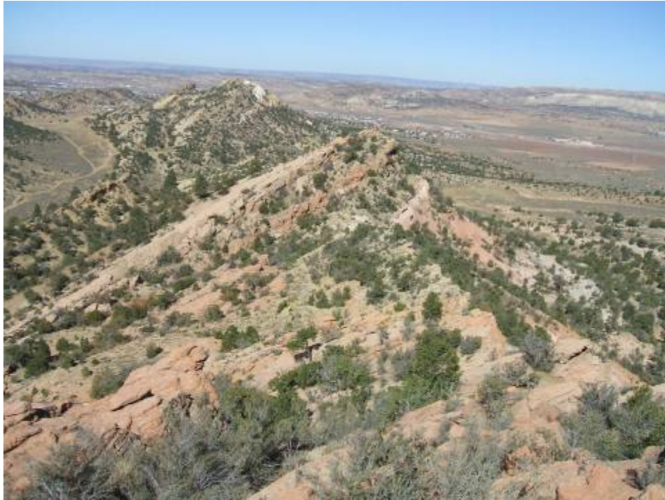
Photo 1. Eunice Becenti mine site, towards the north